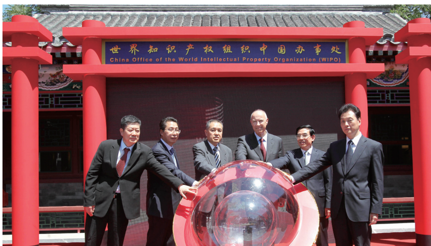
China Office of the WIPO was set up.

On July 10, China Office of the WIPO was set up in Beijing.