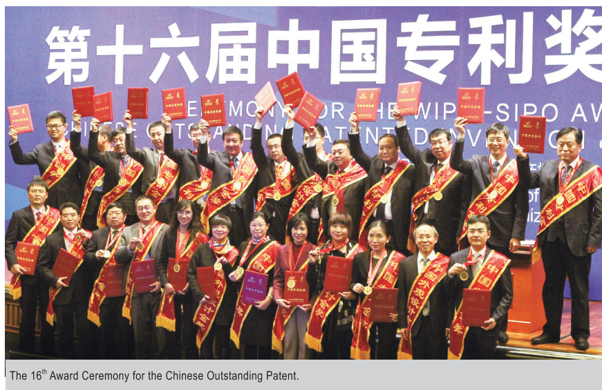
The 16 th Award Ceremony for the Chinese Outstanding Patent.

On December 12, the 16 th Award Ceremony for the Chinese Outstanding Patent was held.