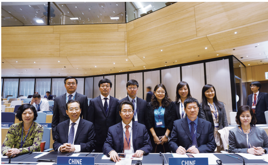
On September 22, Chinese government delegation participated in the 54 th Series of General Assemblies of the Member States of WIPO.

On September 22, Chinese government delegation participated in the 54 th Series of General Assemblies of the Member States of WIPO. SIPO and WIPO signed a cooperation framework agreement. On the sideline of the Assembly, the 3 rd session of the Meeting among Heads of BRICS IP Offices was held.