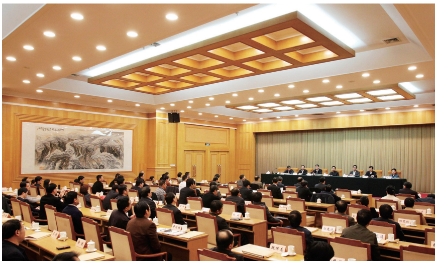
The National Conference of Heads of Intellectual Property Offices.

On January 1, the Managing Provisions of National Standard Involving Patent (provisional) was implemented.