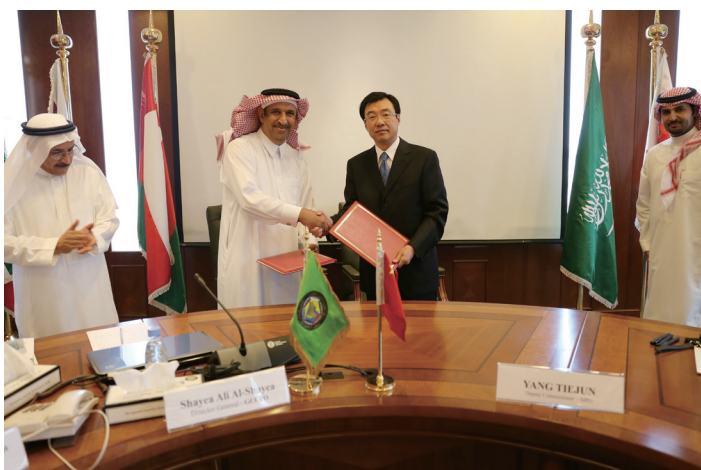
Deputy Commissioner Yang Tiejun visited the GCC Patent Office.

Deputy Commissioner Yang Tiejun visited Patent Office of the Gulf Cooperation Council (GCC), Patent Office of Saudi Arabia and Intellectual Property Office of Qatar, and signed meeting minutes with GCC and Qatar.