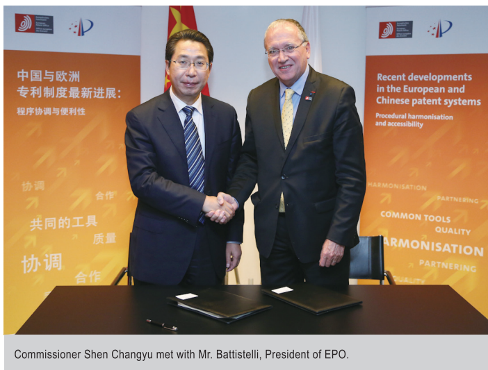
Commissioner Shen Changyu met with Mr. Battistelli, President of EPO.

In 2014, SIPO and EPO continued to carry out high level communication, joint-conference and trainings, which strengthened the traditional friendship and close cooperation.