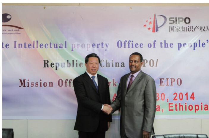
Deputy Commissioner Xiao Xingwei visited Ethiopia Intellectual Property Office.