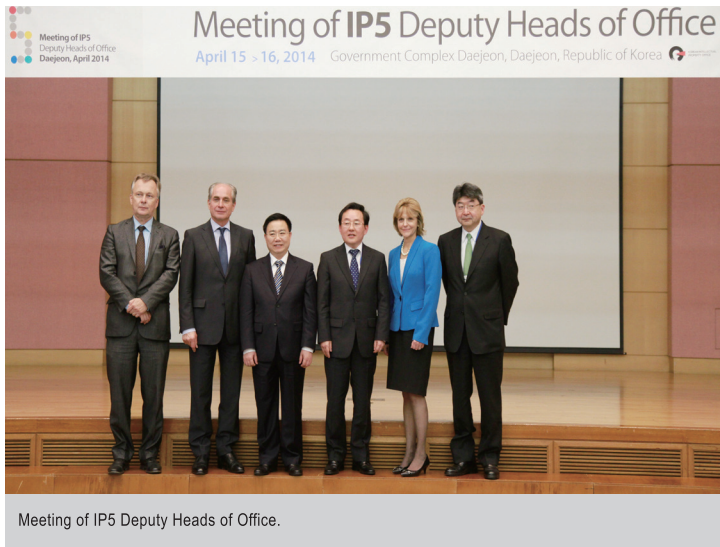
Meeting of IP5 Deputy Heads of Office.