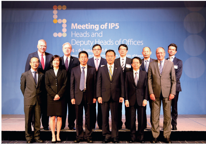
The 7 th meeting of Heads of IP5 Offices.