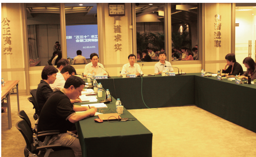
Basic research briefing of the Thirteen-Five planning of patent examination work.

In 2014, the number of concluded applications kept growing, the examination quality was further promoted, the examination was concluded with higher efficiency, the examination pendency kept steady and the examination capacity was further enhanced.