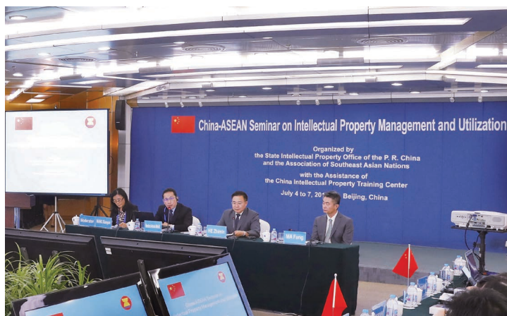
Deputy Commissioner He Zhimin at the China-ASEAN Intellectual Property Management and Utilization Seminar.