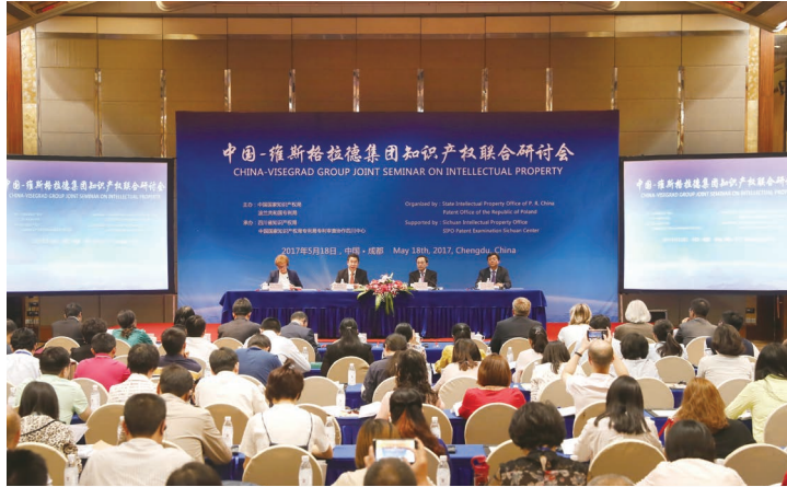
China-Visegrad Group Joint Seminar on Intellectual Property.