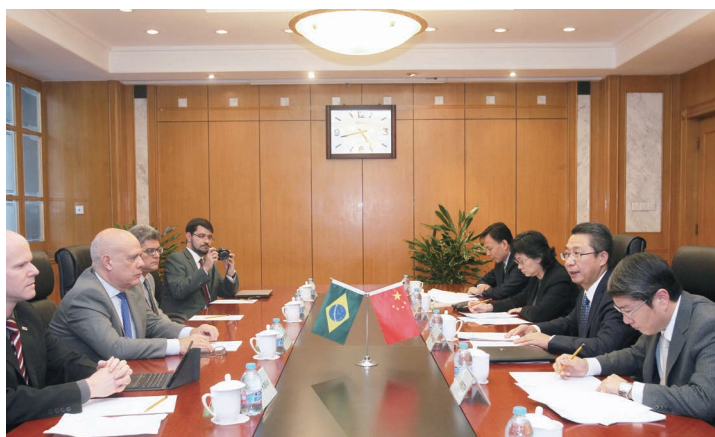
The Heads Meeting between SIPO and the National Institute of Industrial Property of Brazil (INPI).

In November, SIPO held the Heads Meeting between SIPO and the National Institute of Industrial Property of Brazil (INPI) and signed cooperation MOU to launch the pilot program on PPH cooperation between the two offices.