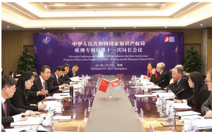
The 11 th Conference of the Heads of SIPO and EPO.

In November, State Councilor Wang Yong met with President of EPO in China. The 11 th Conference of the Heads of SIPO and EPO was held in Zhengzhou and the agreement on the Comprehensive Strategic Partnership and the annual work plan between the two offices were signed.