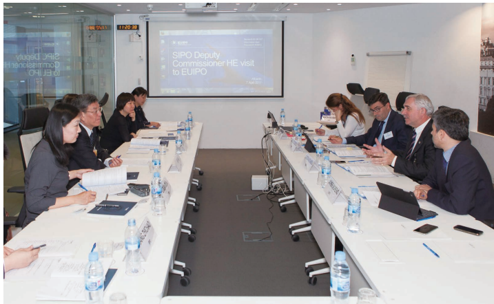
Deputy Commissioner He Hua visited EUIPO and signed the bilateral cooperation work plan for 2017.

In September, Commissioner Shen Changyu completed his first official visit to EUIPO and signed the upgraded MOU between the two offices and an agreement on the exchange of IP information with EUIPO.