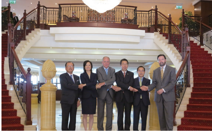
The 10 th Meeting of IP5 Heads of Office.

items, the conclusions of more than 20 pieces of discussion records or Action Lists, and over 1000 items of records or action points.