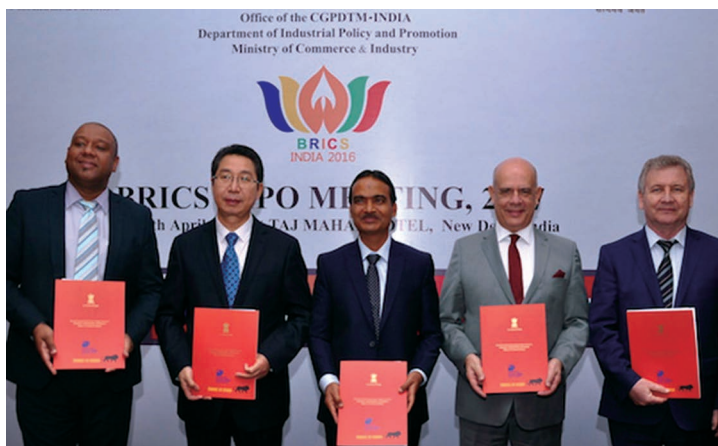
Commissioner Shen Changyu participated in the 8 th BRICS HIPO Meeting.

In October, the 9 th BRICS HIPO Meeting and the 4 th Meeting of BRICS IP Coordination Group were held in Geneva.