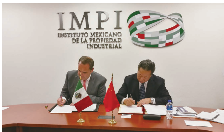
Deputy Commissioner Xiao Xingwei visited Mexican Institute of Industrial Property (IMPI) and signed the cooperation work plan for 2017 and 2018.