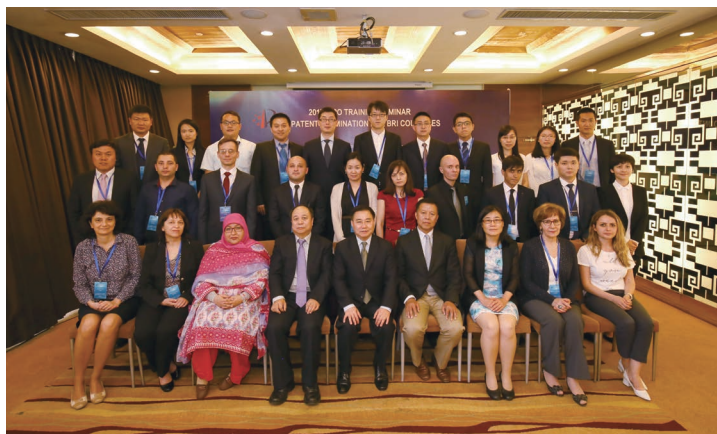
The Training Seminar of Patent Examination for Countries along “Belt and Road” was held in Tianjin city.

The cooperation with “Belt and Road” countries in the area of patent examination gained positive progress. The centralized examination of