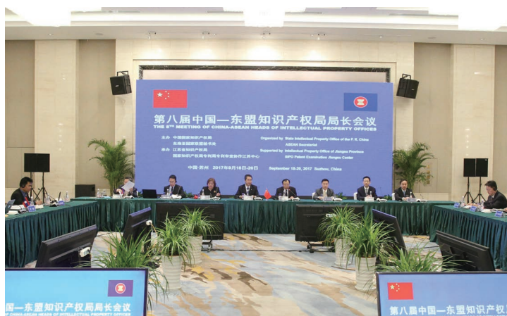
The 8 th Meeting of China-ASEAN Heads of Intellectual Property Offices.

In July, SIPO held the China-ASEAN Intellectual Property Management and Utilization Seminar in Beijing to promote the mutual understanding between