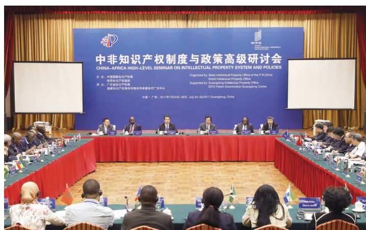
China-Africa High-Level Seminar on IP Systems and Policies.

In July, under the support of WIPO, SIPO held the China-Africa High-Level Seminar on IP Systems and Policies in Guangzhou and carried out exchanges with African countries on legal system and policy, data and information and coordination in international affairs. More than 50 heads and representatives of IP authorities from WIPO, member states of ARIPO, Angola, Egypt and Ethiopia participated in the seminar.