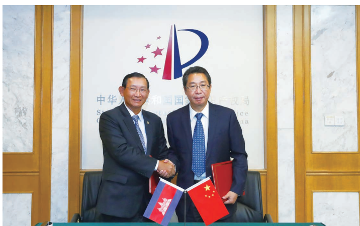
Commissioner Shen Changyu had a meeting with Cham Prasidh, Senior Minister and Minister of Industry and Handicraft (MIH) of Cambodia in Beijing. SIPO and MIH signed a MOU on IP cooperation which provided that any patent granted and remained valid by SIPO could be directly registered and protected by patent rights in Cambodia.

In March, Vice-Premier Liu Yandong witnessed the signature of the cooperation MOU between SIPO and the Ministry of Justice of Israel.