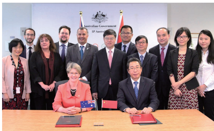
A delegation from SIPO, headed by Commissioner Shen Changyu, visited IP Australia in December.

In December, Commissioner Shen Changyu visited Australia and New Zealand and signed the work plan 2017-2018 with IP Australia and held the IP roundtable in collaboration with the Intellectual Property Office of New Zealand.