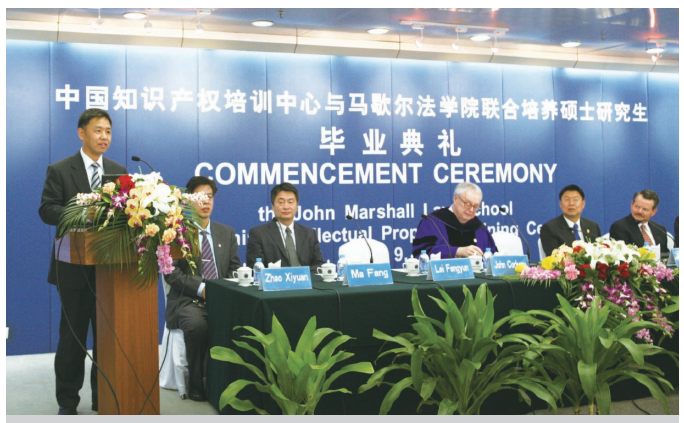
Commencement Ceremony for Post-graduates trained by China Intellectual Property Training Center and John Marshall Law School together.

SIPO formulated the task division schemes, annual work plan and planning policies interpretation in the "12<sup>th</sup> Five-Year Plan for IP Talents"; issued the "Implementation Plans for the 2011-2015 'Project of Millions of IP Talents'", "Implementation Plan for the Construction Project of IP Training Base (2011-2015)", "Implementation Plan for the National IP Talent Pool and Talent Information Network Platform (trial)" and "Implementation Plan for Introducing High-Level IP Talents (2011-2015)"; issued many a policy documents such as "Opinions on Strengthening IP Talents Work", "Work Focuses of National IP Talents in 2011" and so on, which enhanced the macro-guidance for the IP talents work.