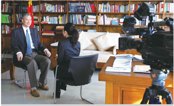
Commissioner Tian Lipu was interviewed by a reporter from CCTV.

Propaganda Department of CPC etc. In November, SIPO organized over 30 news media to cover four major events including China Patent Award Ceremony, Patent Week Opening Ceremony and so on. More than 80 central media including Xinhua News Agency, People's Daily, CCTV, People.com.cn and over 500 local media had produced more than 1,800 news reports in total.