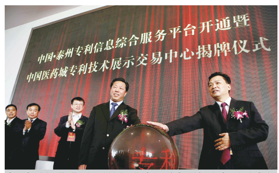
Deputy Commissioner Xiao Xingwei attended the Launching Ceremony for Patent Information Comprehensive Service Platform & Unveiling Ceremony for China Medical City Patent Technology Exhibition and Trading Center in Taizhou.