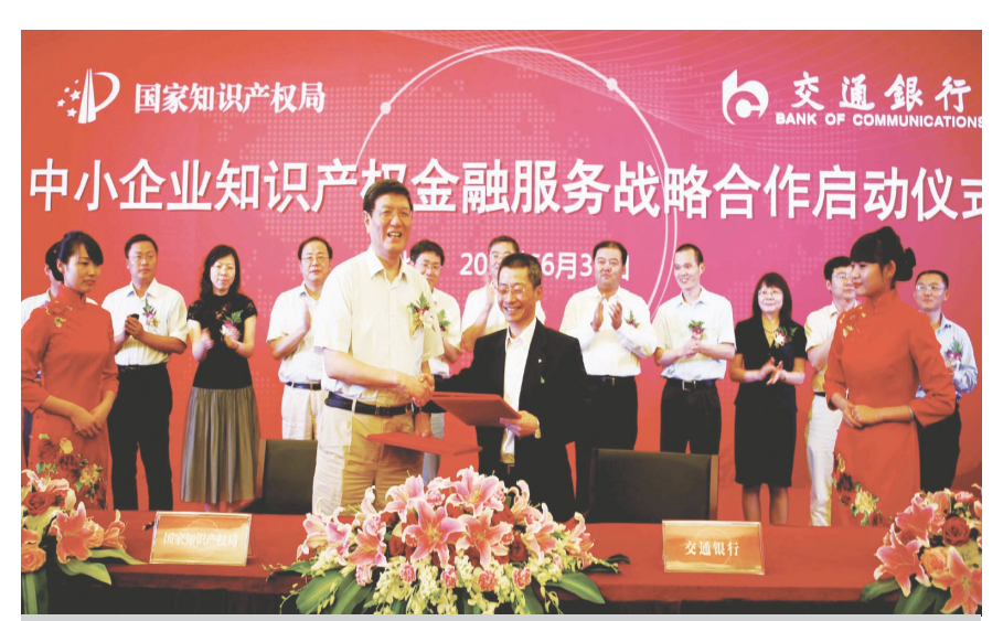
Launching ceremony for Strategic Partnership between SIPO and Bank of Communication Concerning the Financial Services for the Intellectual Property of Medium and Small Enterprises.