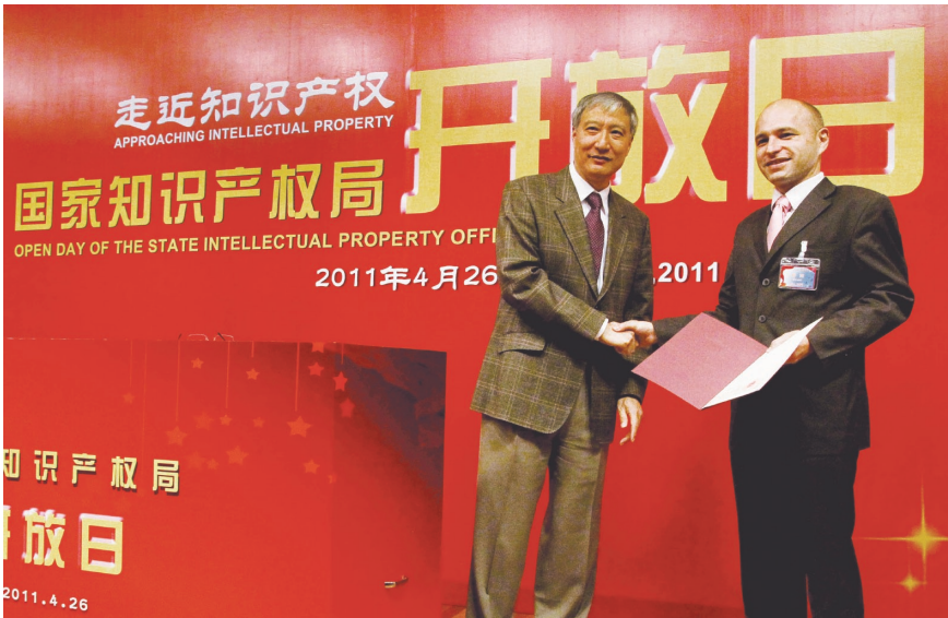
The 6 th Open Day in SIPO.