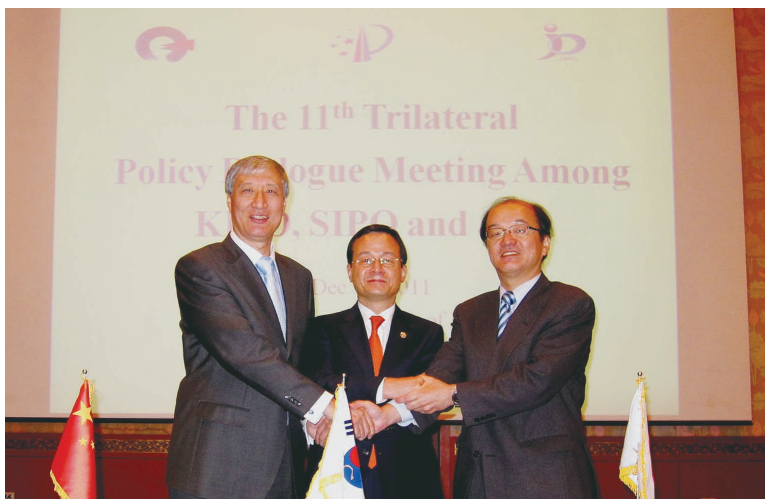
The 11 th Trilateral Policy Dialogue Meeting among KIPO, SIPO and JPO.