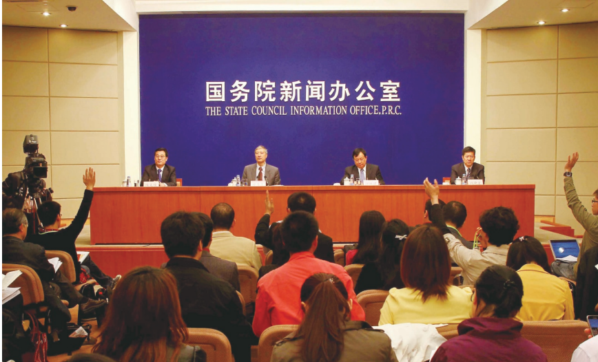
Press Conference on China's Intellectual Property Development in 2010.