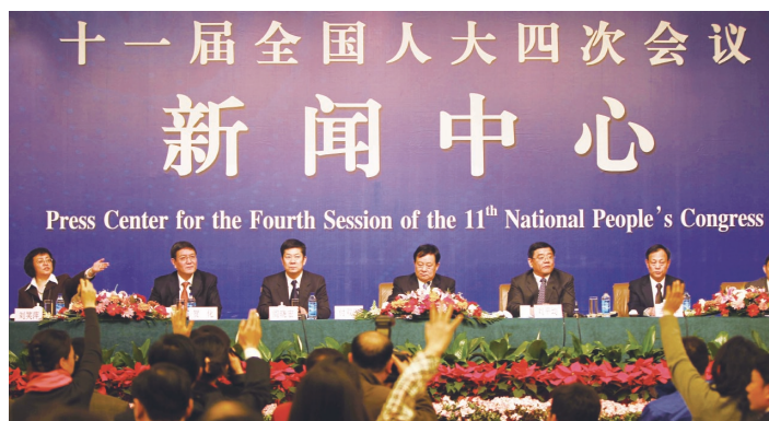
Press Conference on Intellectual Property at the Fourth Session of the Eleventh National People's Congress.