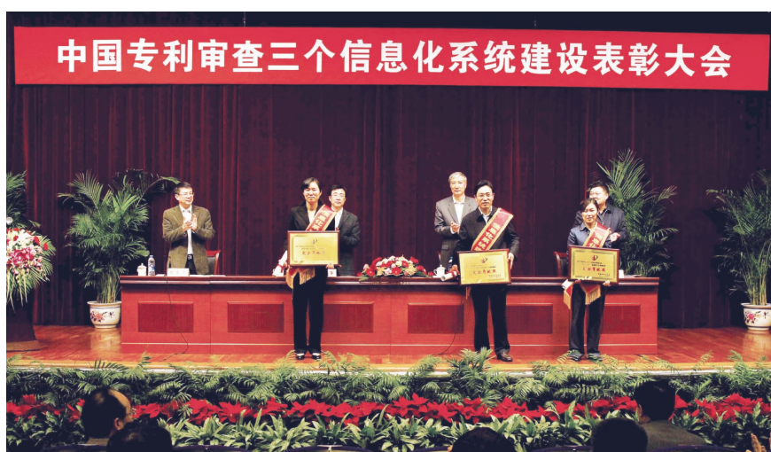
The Commending Ceremony for Outstanding Persons and Groups in the Construction of China's Patent Electronic Examination System.

On April 19, the Commending Ceremony for Outstanding Persons and Groups in the Construction of China's Patent Examination Informationization System was held.