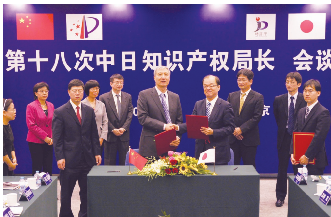
The 18 th Heads Meeting between SIPO and JPO.