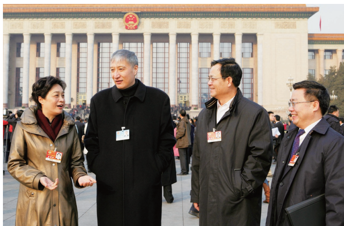
Commissioner Tian Lipu talked with representatives of NPC and members of CPPCC from Intellectual Property system during the Fourth Session of the Eleventh National People's Congress.