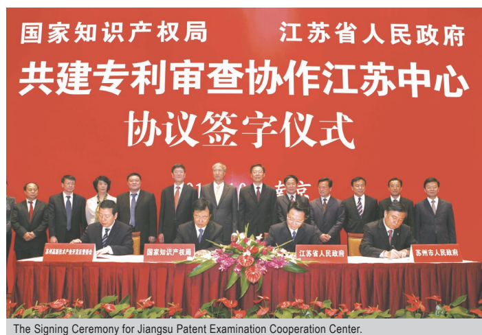
The Signing Ceremony for Jiangsu Patent Examination Cooperation Center.

In 2011, SIPO established Jiangsu Patent Examination Cooperation Center and Guangdong Patent Examination Cooperation Center with Jiangsu Province government and Guangdong Province government respectively. The inspection teams of the Special Campaign against Intellectual Property Infringement and the Production and Sales of Counterfeiting and Forged Commodities led by the senior management of SIPO went to Guangxi, Yunnan, Jiangsu and Fujian for on-site inspection.