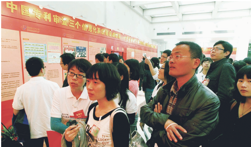
On the 6 th Open Day, guests were attending the Exhibition on the Achievements of the Three Patent Electronic Examination Systems.

On April 28, SIPO held a briefing on the latest developments of SIPO to foreign embassies, chambers of commerce and representatives of foreign enterprises.