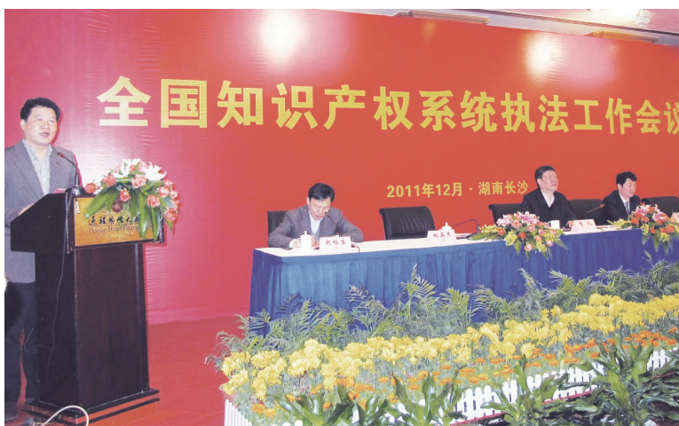
National IP Offices Meeting on Enforcement.

On December 22, National Working Meeting on IP of Entities and the Meeting on Exchanging Experiences in Patent Licensing of National Independent Innovation Model Park were held in Nanchang.