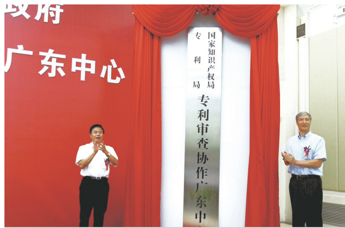
The Unveiling Ceremony for Guangdong Patent Examination Cooperation Center.