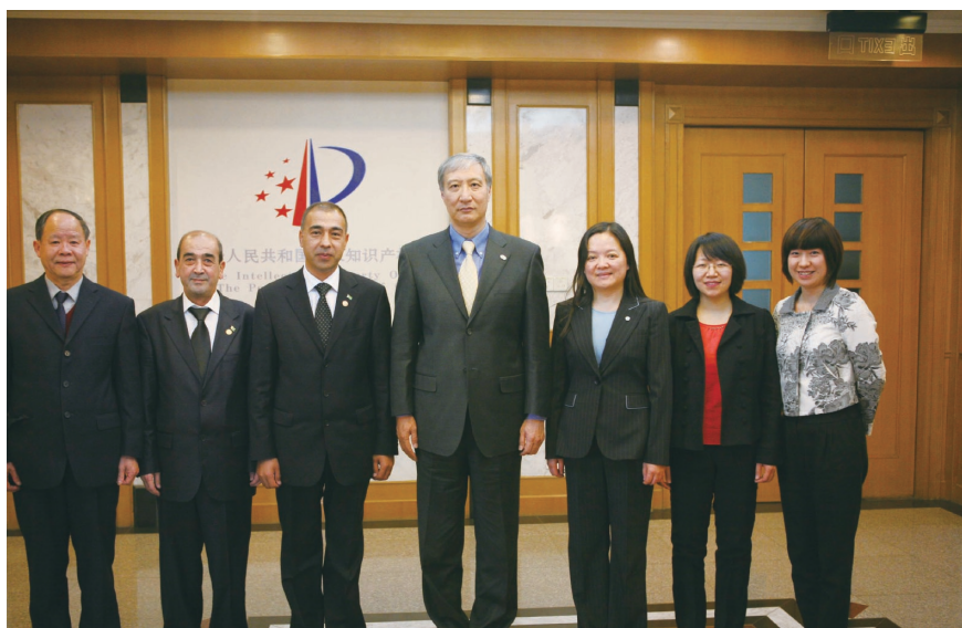
Commissioner Tian Lipu met with Mr. Taganov, Deputy Minister of the Ministry of Economy and Development of Turkmenistan.