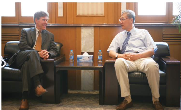
Commissioner Tian Lipu met with Chief Judge of CAFC.

On June 14, Commissioner Tian Lipu met with Randall R. Rader, Chief Judge of the United States Court of Appeals for the Federal Circuit (CAFC).