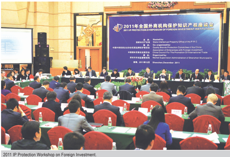
2011 IP Protection Workshop on Foreign Investment.

From December 11 to 14, a delegation led by Commissioner Tian Lipu attended the OAPI Administrative Council Meeting in Guinea.