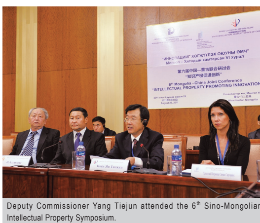
Deputy Commissioner Yang Tiejun attended the 6 th Sino-Mongolian Intellectual Property Symposium.

On August 29, SIPO and the Intellectual Property Office of Mongolia jointly held the 6 th Sino-Mongolian Intellectual Property Symposium in Ulan Bator.