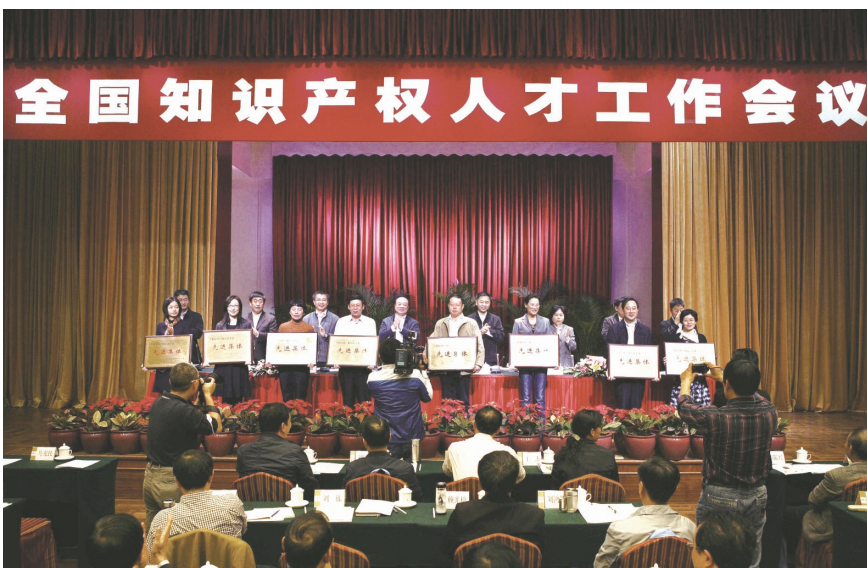
The First National Meeting for the Work of IP Talents.