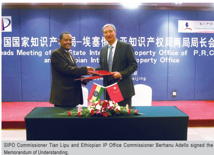
SIPO Commissioner Tian Lipu and Ethiopian IP Office Commissioner Berhanu Adello signed the Memorandum of Understanding.

On November 13, Commissioner Tian Lipu met with foreign participants of the Seminar of Heads of Intellectual Property Offices of Members of African Regional Intellectual Property Organization (ARIPO). The workshop was jointly organized by SIPO, WIPO and ARIPO. During the Seminar, Commissioner Tian Lipu and Commissioner Berhanu Adello from Ethiopian IP Office signed the Memorandum of Understanding between the two offices.