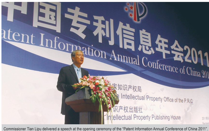
Commissioner Tian Lipu delivered a speech at the opening ceremony of the "Patent Information Annual Conference of China 2011".

On September 5, Commissioner Tian Lipu attended the “Patent Information Annual Conference of China 2011” and delivered a speech.