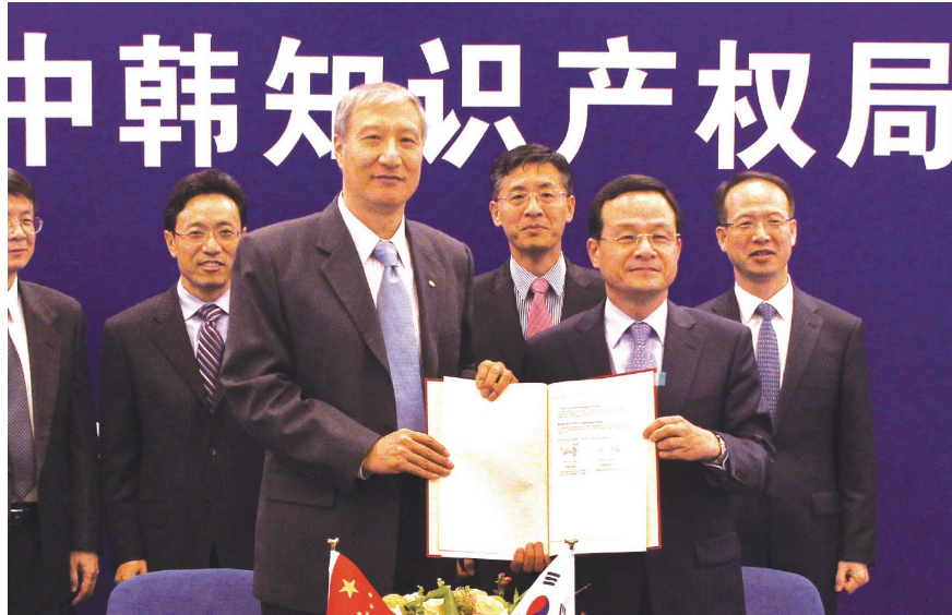
Heads of SIPO and KIPO signed the Record of Discussion.

From November 1 to 3, the 17 th Heads Meeting between SIPO and the Korea Intellectual Property Office (KIPO) was held in Beijing, in which the Record of Discussion was signed.