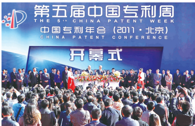
The Opening Ceremony for the 5 th China Patent Week.