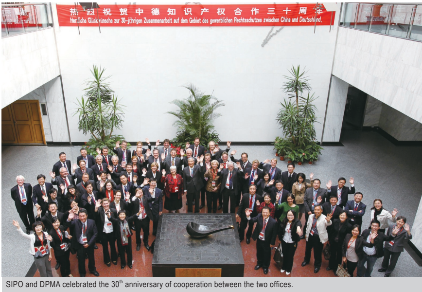
SIPO and DPMA celebrated the 30 th anniversary of cooperation between the two offices.