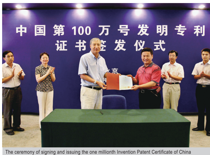
The ceremony of signing and issuing the one millionth Invention Patent Certificate of China

On July 16, SIPO held the ceremony of signing and issuing the one millionth Invention Patent Certificate of China.