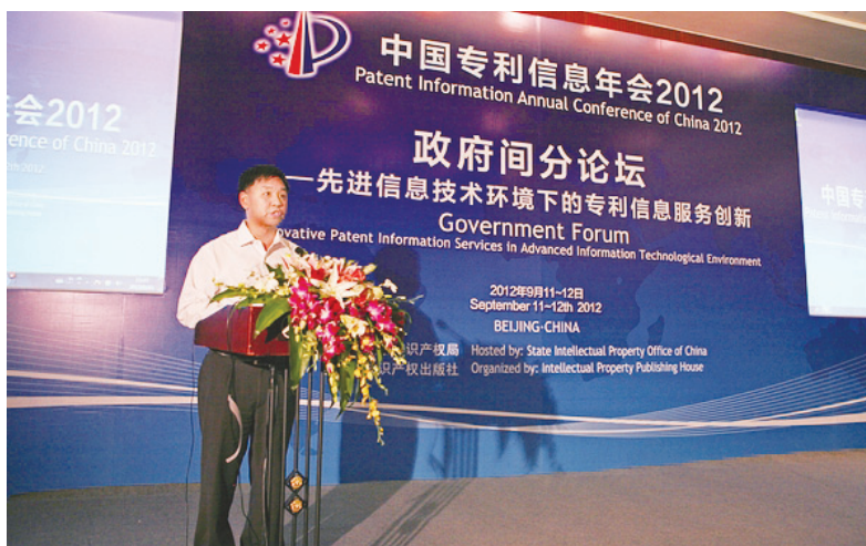
Deputy Commissioner Gan Shaoning delivered a keynote speech at the 2012 Patent Information Annual Conference of China.