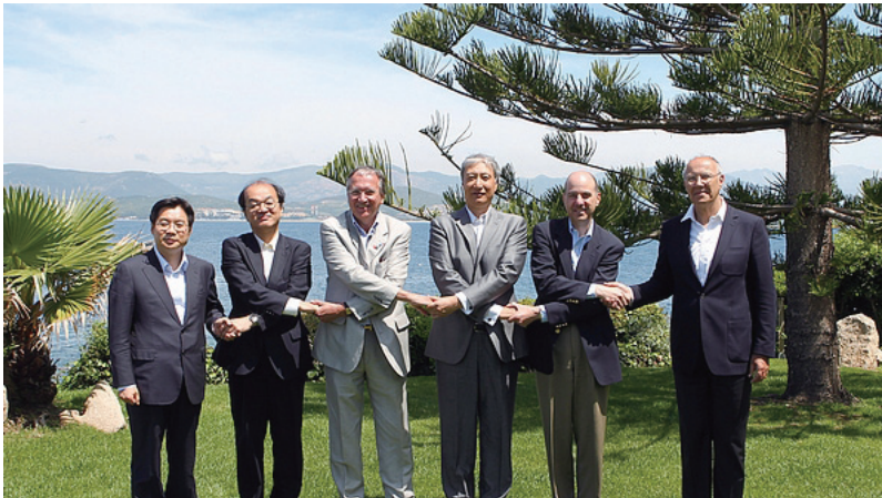
The 5 th IP5 Heads Meeting in Corsica, France

On June 6, Commissioner Tian Lipu led a delegation to Corsica to attend the 5 th IP5 Heads Meeting and held the bilateral joint committee meeting with the National Institute of Industrial Property of France.