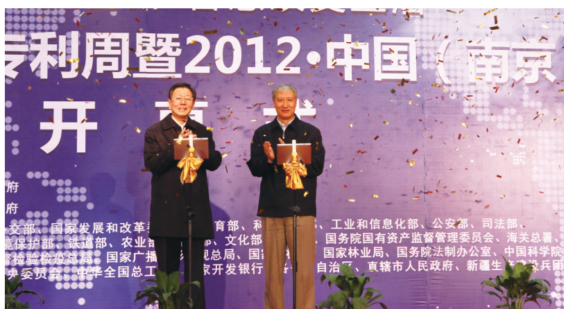
The Opening Ceremony of the 6 th China Patent Week

On November 29, SIPO organized the 6 th China Patent Week. On the same day, the China Enterprise Intellectual Property Website ( www.cneip.org.cn ) was officially launched and the Award Ceremony of the 7 th Competition of Industrial Design Patent was held in Nanjing, Jiangsu Province.