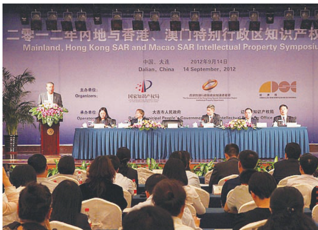
The Mainland, Hong Kong SAR and Macao SAR Intellectual Property Symposium 2012

On September 14, the Mainland, Hong Kong SAR and Macao SAR Intellectual Property Symposium 2012 was held in Dalian, jointly organized by SIPO, the Intellectual Property Department of Hong Kong SAR and the Economics Department of Macao SAR.