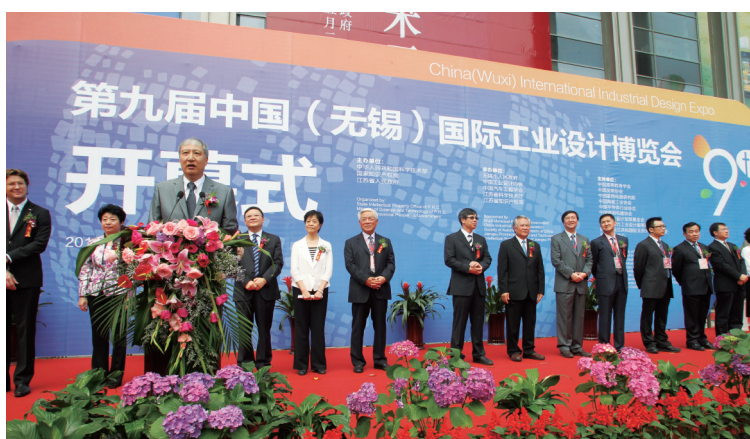
The 9 th China (Wuxi) International Industrial Design Exposition

On May 26, the 9 th China (Wuxi) International Industrial Design Exposition was inaugurated, co-hosted by SIPO, the Ministry of Science and Technology and the Jiangsu provincial government.