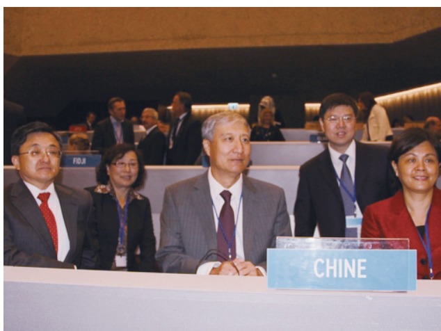
The Chinese delegation led by Commissioner Tian Lipu participated in the 50 th series of meeting of the Assemblies of the Member States of WIPO.

On October 1, the Chinese delegation led by Commissioner Tian Lipu participated in the 50 th series of meeting of the Assemblies of the Member States of WIPO.