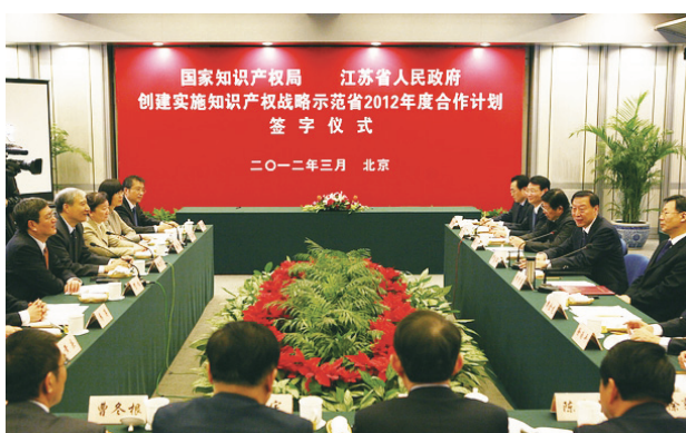
SIPO and Jiangsu provincial government held the signing ceremony of the 2012 Annual Cooperation Plan on Establishing the Demonstration Province of Implementing Intellectual Property Strategy, Commissioner Tian Lipu, Deputy Commissioners He Hua and Bao Hong attended the ceremony.

On March 8, SIPO and Jiangsu provincial government held the signing ceremony of the 2012 Annual Cooperation Plan on Establishing the Demonstration Province of Implementing Intellectual Property Strategy in Beijing.