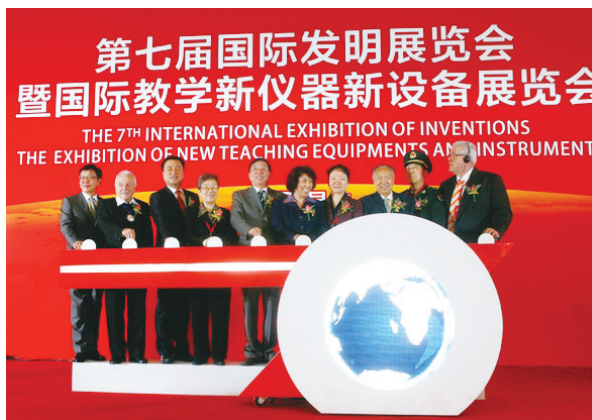
Deputy Commissioner Bao Hong attended the 7 th International Exhibition of Inventions.

From November 9-12, the 7 th International Exhibition of Inventions was held in Kunshan, Jiangsu Province, and Deputy Commissioner Bao Hong attended the event.