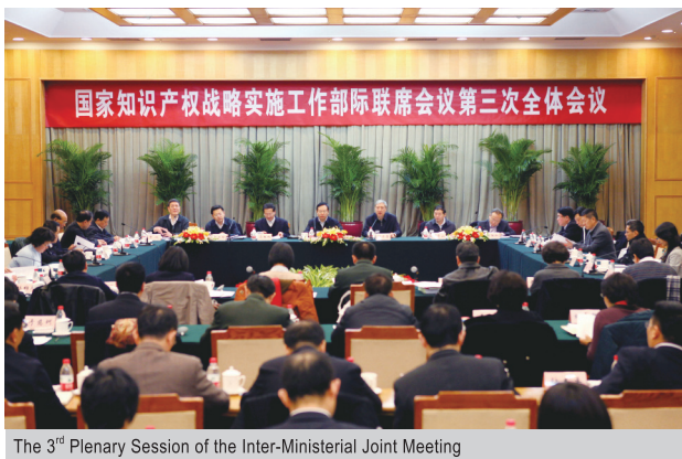
The 3 rd Plenary Session of the Inter-Ministerial Joint Meeting

On February 24, the 3 rd Plenary Session of the Inter-Ministerial Joint Meeting on the Implementation of the National Intellectual Property Strategy was held in Beijing.