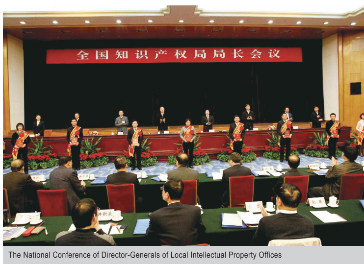
The National Conference of Director-Generals of Local Intellectual Property Offices

On January 5, the National Conference of Director-Generals of Local Intellectual Property Offices was held in Beijing.