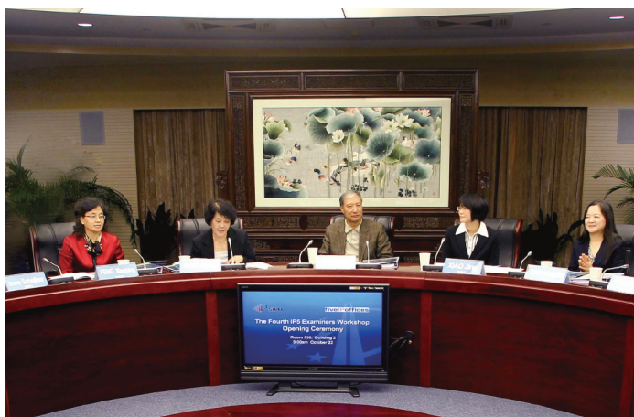
Commissioner Tian Lipu attended the 4 th IP5 Examiners Symposium.

On October 22, SIPO held the 4 th IP5 Examiners Symposium in Beijing.