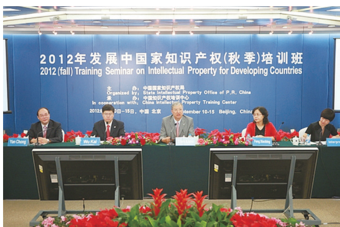
Commissioner Tian Lipu delivered an opening speech at the 2012 (Autumn) Training Seminar on Intellectual Property for the Developing Countries.

From September 10-22, SIPO held the 2012 (Autumn) Training Seminar on Intellectual Property for the Developing Countries, and 32 officials from Argentina, Brazil, Mexico, Chile, Vietnam, Kyrgyzstan, Mongolia and North Korea attended the Seminar.