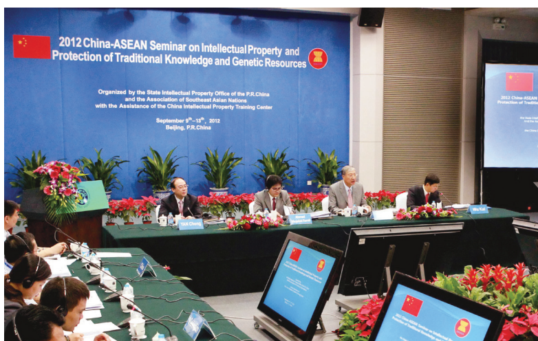
China-ASEAN Seminar on Intellectual Property and Protection of Traditional Knowledge and Genetic Resources

On September 11, China-ASEAN Seminar on Intellectual Property and Protection of Traditional Knowledge and Genetic Resources was held in Beijing. On the same day, the 2012 Patent Information Annual Conference of China was held in Beijing.