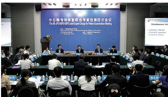
Deputy Commissioner Yang Tiejun attended the 4 th Joint Experts Group for Patent Examination among SIPO, JPO and KIPO.

From September 3-4, the 4 th Joint Experts Group Meeting for Patent Examination among SIPO, JPO and KIPO was held in Beijing.