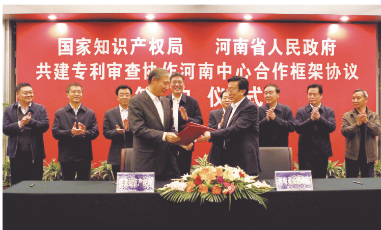
The signing ceremony of the Cooperation Framework Agreement on Co-constructing the Patent Examination Cooperation Center (Henan) of the Patent Office of SIPO with Henan provincial government.