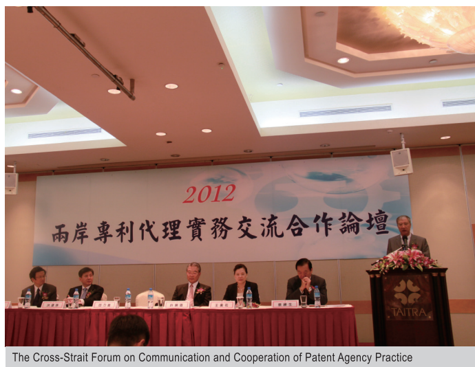
The Cross-Strait Forum on Communication and Cooperation of Patent Agency Practice