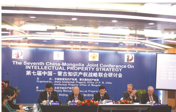
Deputy Commissioner Yang Tiejun presented and delivered a speech at the 7 th China-Mongolia Joint Conference on Intellectual Property Strategy.

On March 5, the 7 th China-Mongolia Joint Conference on Intellectual Property Strategy was held in Beijing.