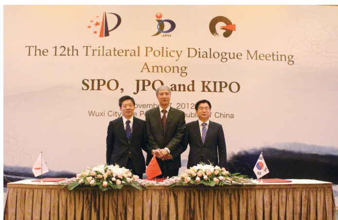
The 12 th Trilateral Policy Dialogue Meeting among SIPO, JPO and KIPO

On November 7, SIPO hosted the 12 th Trilateral Policy Dialogue Meeting among SIPO, JPO and KIPO in Wuxi, Jiangsu Province.