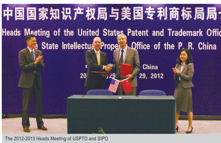
The 2012-2013 Heads Meeting of USPTO and SIPO

On May 29, the 2012-2013 Heads Meeting of USPTO and SIPO was held in Beijing.