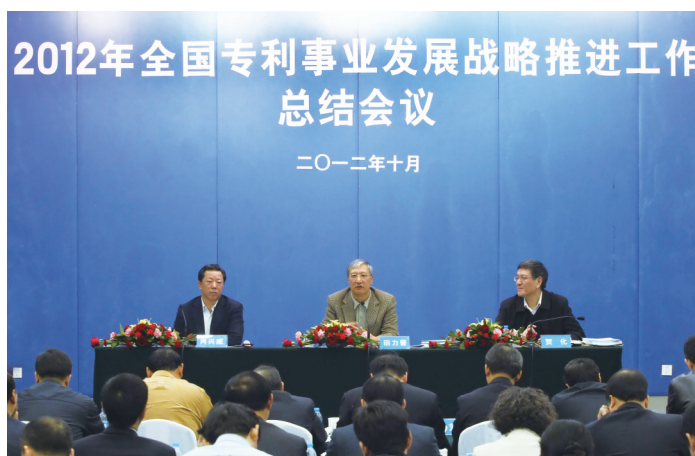
Commissioner Tian Lipu, Deputy Commissioners He Hua and Xiao Xingwei attended the 2012 Summary Meeting on Promoting the National Patent Development Strategy.

On October 30, SIPO held the 2012 Summary Meeting on Promoting the National Patent Development Strategy.