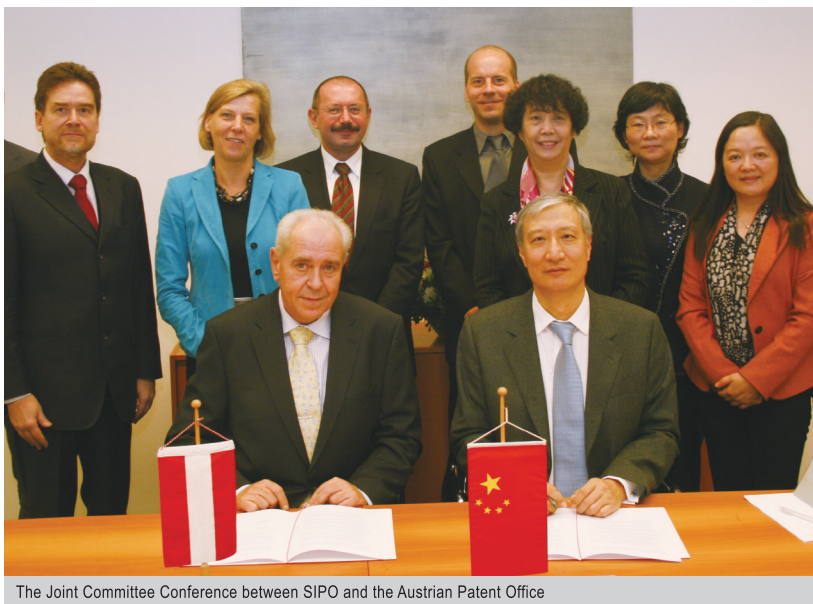
The Joint Committee Conference between SIPO and the Austrian Patent Office

Switzerland, Finland, Denmark, Iceland, Russia, Moldova and Kyrgyzstan, among which the MOU signed with OHIM has elevated bilateral cooperation relation to Strategic Cooperative Partnership.