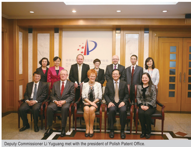
Deputy Commissioner Li Yuguang met with the president of Polish Patent Office.

SIPO signed 17 bilateral cooperation agreements, memorandum of understandings, and work plans with regional organizations including EPO, OHIM, as well as countries including Germany, France, Austria,