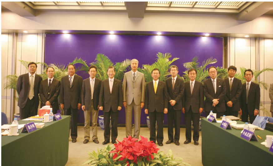
Commissioner Tian Lipu met with the high-level Japanese Official-Civilian delegation on IP protection.