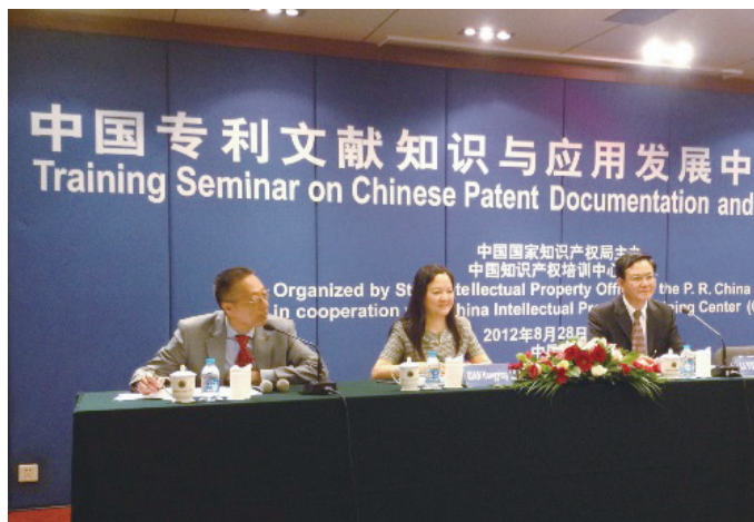
The Training Seminar on Chinese Patent Documentation and Utilization