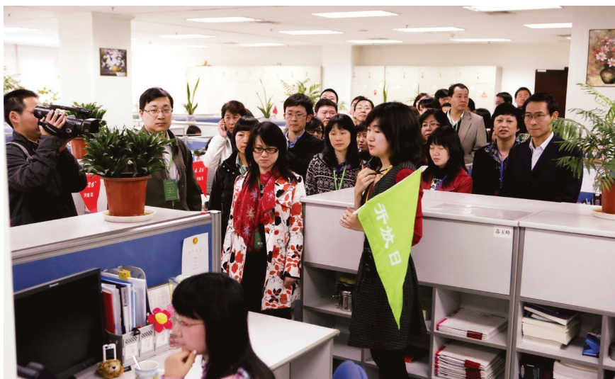
People visited the patent office on the Open Day of SIPO.

On April 28, SIPO held the Briefing on the Latest Developments of SIPO for foreign embassies, chambers of commerce and representatives of foreign enterprises in Beijing. Commissioner Tian Lipu attended the briefing and delivered the opening address. On the same day, the State Council Information Office issued a press release on the progress made in China's intellectual property development.