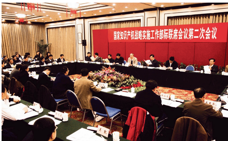
On March 1, the second plenary session of the Interdepartmental Joint Meeting on the Implementation of the National Intellectual Property Strategy was held in Beijing.

held in Beijing. Commissioner Tian Lipu, the convener of the session, hosted the meeting and presented a paper to the session. Vice Secretary-General Bi Jingquan of the State Council attended and addressed the session. The session was also attended by 14 ministerial leaders and more than 80 liaisons from 28 member departments of the Joint Meeting. On March 26, the China's