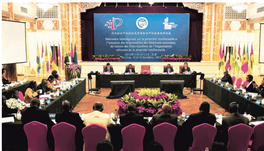
The Seminar of Heads of Intellectual Property Offices of Members of African Regional Intellectual Property Organization (ARIPO) was held in Beijing.