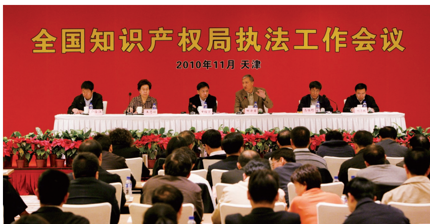
The National Meeting on Enforcement of Intellectual Property Administrations took place in Tianjin.