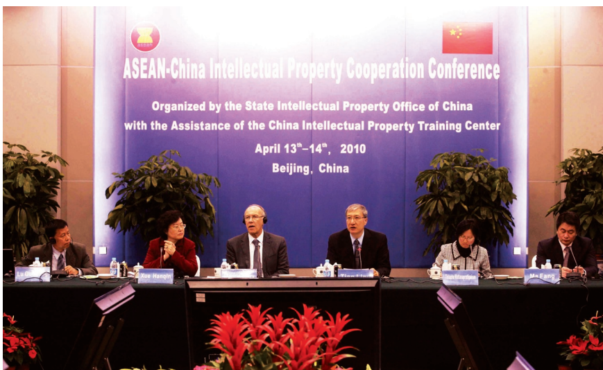
The ASEAN-China Intellectual Property Cooperation Conference was held in Beijing.