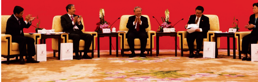
On April 1, the Symposium in honor of the 25 th Anniversary of the Implementation of the Patent Law was held in the People's Great Hall.

主办：全国人大教科文卫委员会 全国人大常委会法制工作委员会 国务院法制办公室 国家知识产权局