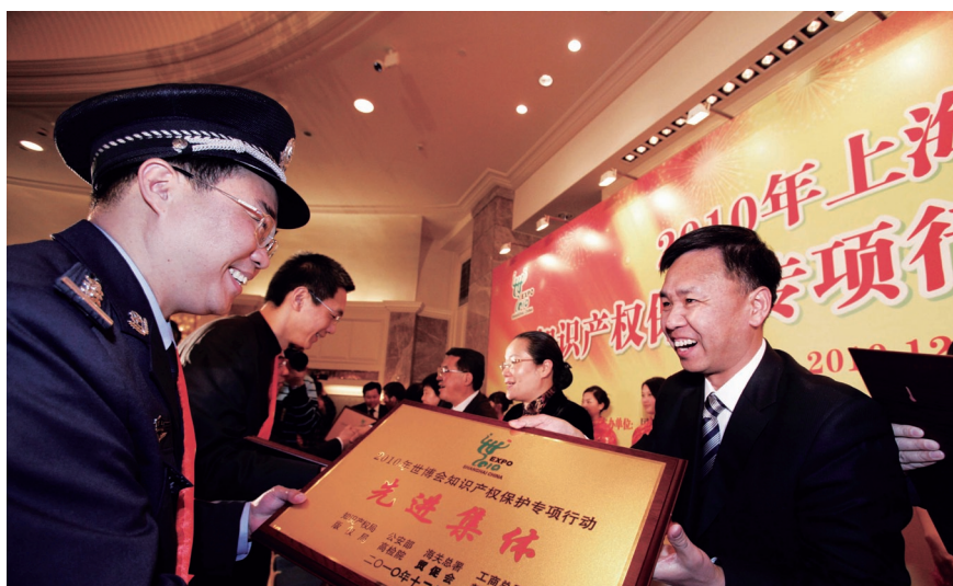
The honoring ceremony of the national special campaign on intellectual property protection of Shanghai Expo 2010 was held.