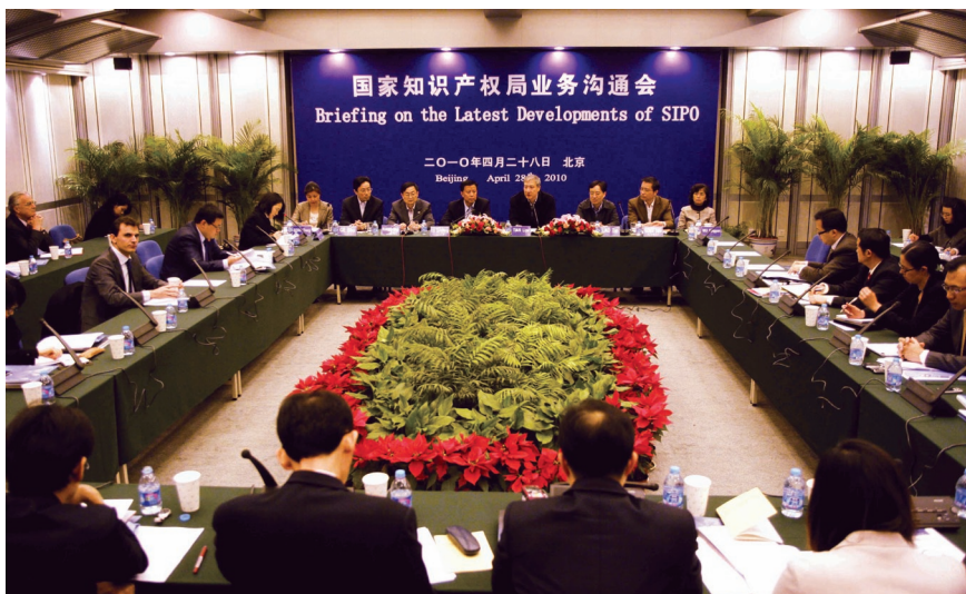
The Briefing on the Latest Developments of SIPO was held in Beijing.