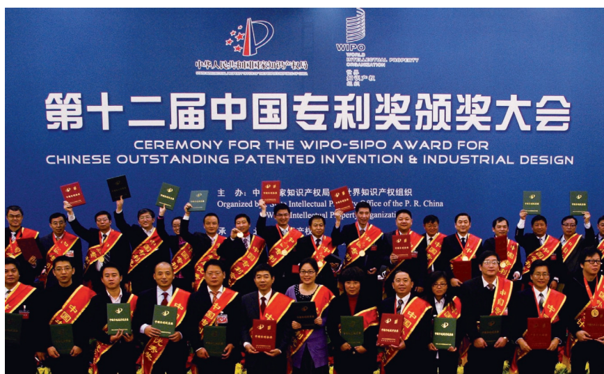
Recipients of the 12 th Conference of China Patent Award.

On November 26, the 7 th Shanghai International Intellectual Property Forum opened, which featured the theme of "Intellectual Property and the Innovative City". Commissioner Tian Lipu attended the opening ceremony and delivered a remark.