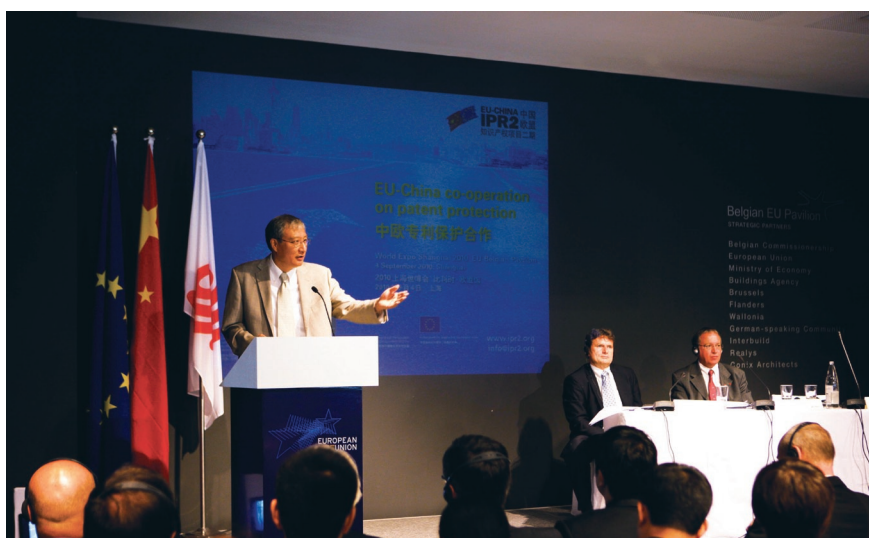
Commissioner Tian Lipu answered questions from journalists at the press release on the 25 th Anniversary of China-Europe Intellectual Property Cooperation.

European Commission, attended the press release on the 25 th Anniversary of China-Europe Intellectual Property Cooperation in the EU-Belgium Pavilion of the World Expo Park.