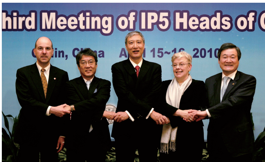
On April 15, the 3 rd Meeting of IP5 Heads of Office took place in Guangxi.

On April 20, to celebrate the 10 th World Intellectual Property Day themed "Creation, Protection, Development", 25 departments, including SIPO and the Publicity Department of the Central Committee of CPC jointly held a ceremony for launching the "2010 National Intellectual Property Publicity Week" in Beijing. Commissioner Tian Lipu, head of the organizing committee, delivered a speech, and WIPO Director-General Francis Gurry sent a congratulatory message to the event. The publicity week included a series of events, including the upgrading of the Intellectual Property Channel of www.people.com.cn , the ceremony for launching the English version of the channel, the publication of the China's Intellectual Property Protection 2009 and an Open Day in SIPO. On the same day, Special Campaign for National Intellectual Property Enforcement and Protection 2010 and the ceremony for launching an Open Day in the China (Beijing) Intellectual Property Rights Assistance Center in Beijing.