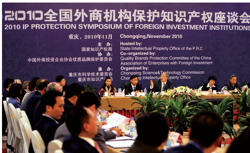
The 2010 IP Protection Symposium of Foreign Invested Enterprises was held in Chongqing.

From November 7 to 13, SIPO held the Fourth China Patent Week. SIPO worked together with relevant authorities to hold the 2010 IP Protection Symposium of Foreign Invested Enterprises in Chongqing, and Commissioner Tian Lipu attended and addressed the meeting.