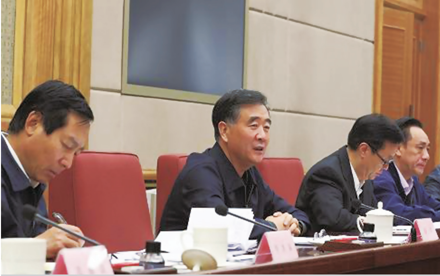
On November 13, Vice Premier Wang Yang chaired the Third Plenary Meeting of the Leading Group of the Special Campaign against Intellectual Property Infringement and the Production and Sales of Counterfeiting and Forged Commodities in Beijing.