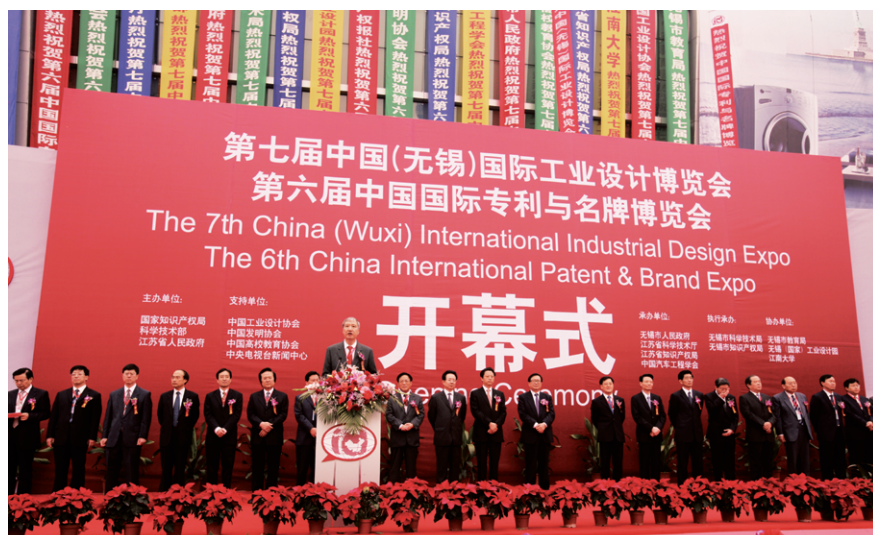
On November 7, the 7th China International Industrial Design Expo and the 6th China International Patent&Brand Expo were held in Wuxi.

Cooperation with EPO: In June and October, SIPO-EPO Examiner Training Courses were held in Beijing; From July 29 to August 3, Seminars on European Patent System was held in Beijing, Nanjing and Zhengzhou; In December, Roving Seminars on Third Amendment of Chinese Patent Law were held in Munich, Stockholm, the Hague and Milan.