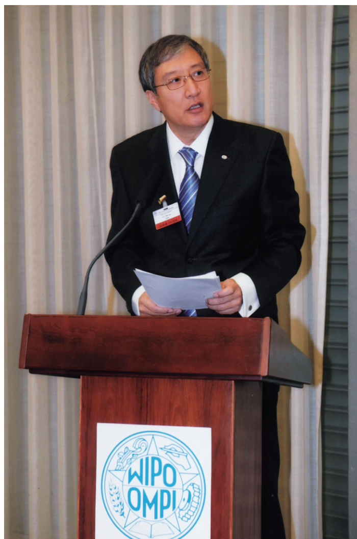
On September 24, Commissioner Tian Lipu attended the 47th Series of Meetings of the Assemblies of the Member States of WIPO.

delegation composed of officials from SIPO, SAIC, NCAC and Ministry of Foreign Affairs to attend the 47th Series of Meetings of the Assembly of the WIPO Member States. SIPO's leaders met with heads or senior officials from US, Japan, Europe, Republic of Korea, France, Sweden, Brazil, India and Algeria for bilateral cooperation.