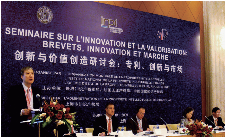
From May 12 to 13, Sino-France IP Seminar was held in Shanghai.