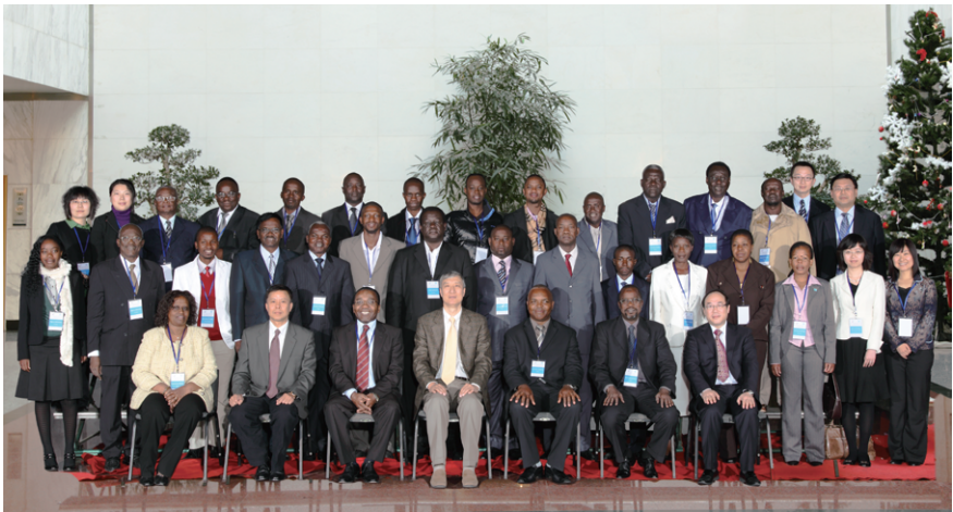
In December, SIPO joined WIPO in holding Training Course for African Senior IP Officials from ARIPO and OAPI at CIPTC.

In December, SIPO joined WIPO in holding Training Course for African Senior IP Officials at CIPTC with participation of 24 officials from African Regional Intellectual Property Organization (ARIPO) and 28 officials from l'Organisation Africaine de la Propriété Intellectuelle (OAPI).