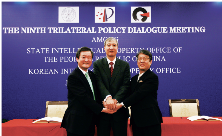
On December 21 to 22, the 9th SIPO-JPO-KIPO Dialogue Meeting of Heads was held in Xi'an.

In April, four GCC patent examiners received a two-week patent examination training in SIPO.