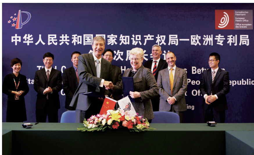
On December 3, the third EPO-SIPO Bilateral Heads Meeting was held in Beijing.