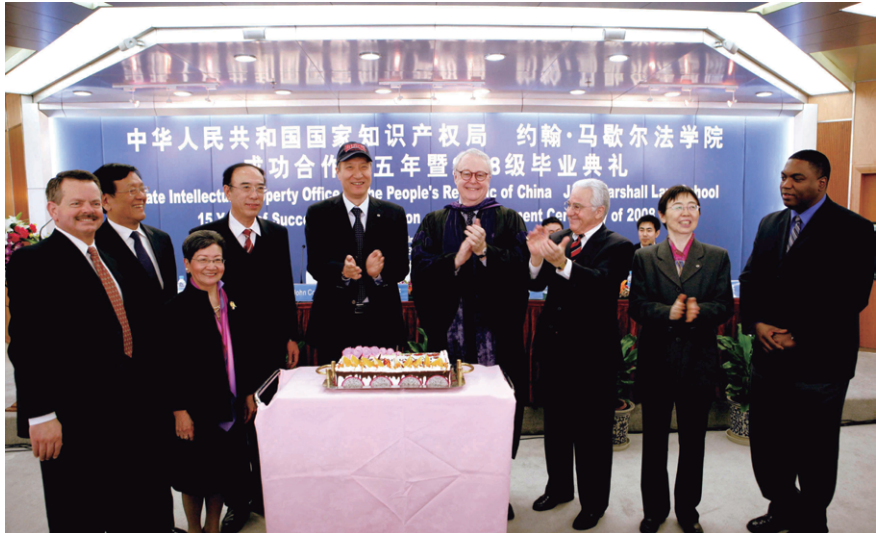
On March 9, SIPO and the John Marshall Law School of the United States celebrated their 15 years of cooperation.

From April 22 to 24, SIPO and USPTO held the Seminar on Patent Filing and Protection in Hangzhou and Shenzhen. Participants discussed patent filing strategy, patent litigation procedure and 337 investigation procedures.