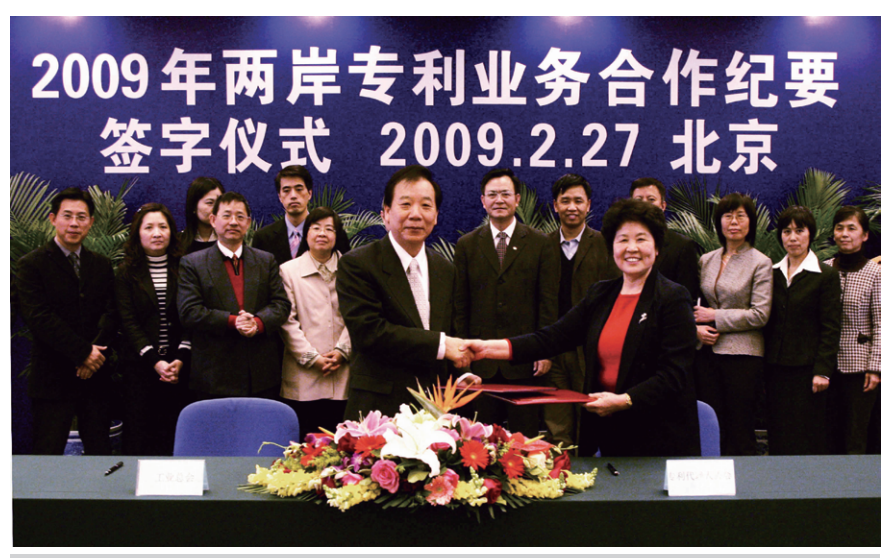
On February 27, All-China Association of Patent Agents and Taiwan Industrial Association signed the 2009 Record of Discussion of Cross-Strait Patent Cooperation in Beijing.