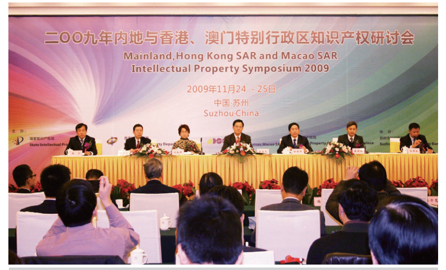
On November 24, SIPO, Intellectual Property Department of HK SAR and Macao Economic Services held the Mainland, HK SAR, Macao SAR Intellectual Property Symposium.

From November 24 to 25, SIPO, Intellectual Property Department of HK SAR and Macao Economic Services held the Mainland, HK SAR, Macao SAR Intellectual Property Symposium.