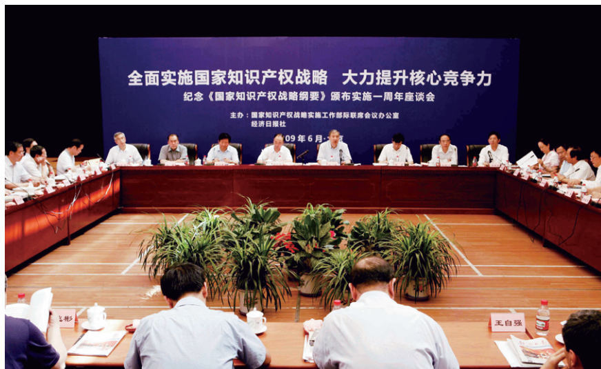
On June 2, the conference commemorating the one year anniversary of the implementation of Outline of the National IP Strategy was held in Beijing.

On June 3, SIPO held a press conference to announce the Development Plan for Patent Agency (2009-2015).