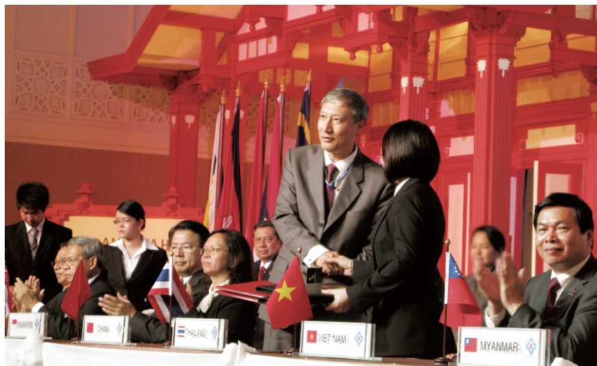
On October 25, Commissioner Tian Lipu signed Memorandum of Understanding between the Government of the Member States of the Association of Southeast Asian Nations and the Government of the People's Republic of China on Cooperation in the Field of Intellectual Property.

On November 16, the 11th China High-tech Fair, including a SIPO-sponsored