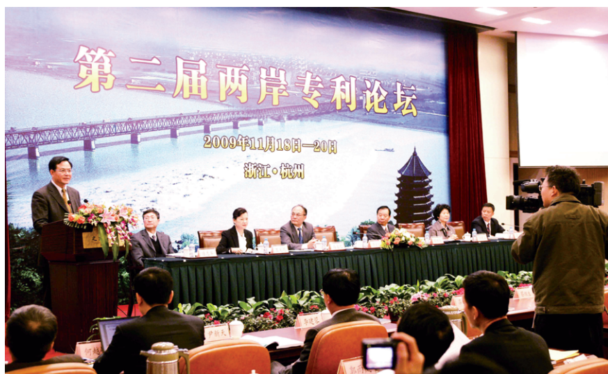
On November 18, Deputy Commissioner Li Yuguang attended the Second Cross-Straits Patent Forum in Hangzhou, Zhejiang.