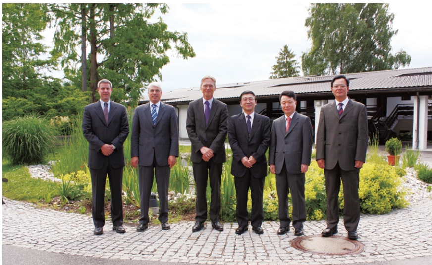
From June 10 to 12, the second IP5 Deputy Heads Meeting was held in Murnau, Germany.