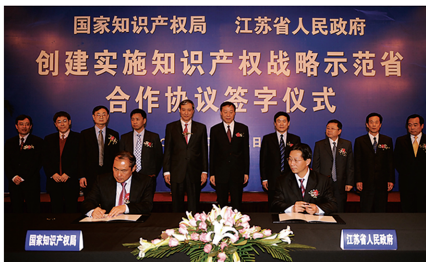
On February 15, SIPO signed a cooperation agreement with Jiangsu Provincial Government in Nanjing to jointly build a model province in implementing national IP strategy.

On March 19, the office of the inter-ministerial committee for implementation