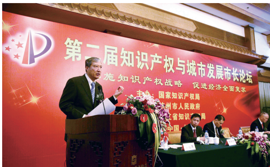
On November 17, SIPO held the Second Mayor Forum on IP and City Development in Hangzhou.

On November 24 and 25, SIPO, the Intellectual Property Department of HKSAR and the Macao Economic Services jointly organized the 2009 Mainland, HKSAR, Macao SAR Intellectual Property Symposium in Suzhou.