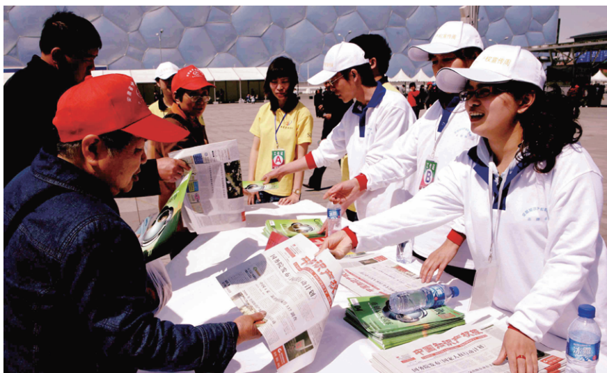
2009 National IP Publicity Week