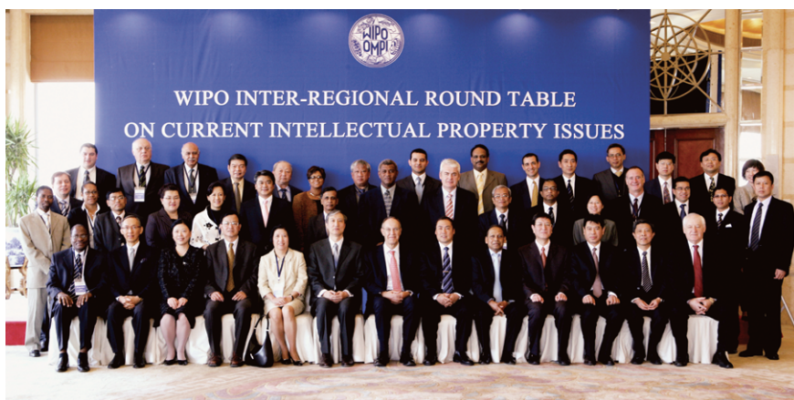
The WIPO Inter-Regional High-Level Forum on Intellectual Property was held on March 30 in Beijing.

The WIPO Inter-Regional High-Level Forum on Intellectual Property was held on March 30 in Beijing. Wang Qishan, Vice Premier, and Francis Gurry, Director General of the WIPO, delivered the keynote speeches. Wang stressed dialogue and cooperation shall be enhanced to promote mutual benefit. On the same day, SIPO printed and distributed the Action Plan on IP Enforcement Campaigns Thunderstorm and Skynet 2009 .