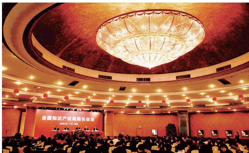
On February 4-5, a meeting of the heads of IP administrations nationwide was held in Zhuhai, Guangdong.

On February 4 and 5, a meeting of the heads of IP administrations nationwide was held in Zhuhai, Guangdong.