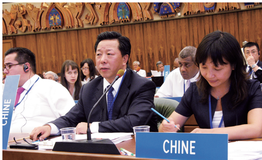
On June 29, Deputy Commissioner Xiao Xingwei attended the 14th Meeting of WIPO Intergovernmental Committee on Genetic Resources, Traditional Knowledge and Folklore.

In July, Tian Lipu was selected 50 Most Influential People in IP 2009 by Managing IP .