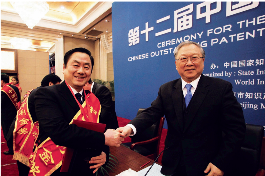
Lu Yongxiang, Vice Chairman of the NPC Standing Committee, attended the 12 th Conference of China Patent Award and conferred the awards.