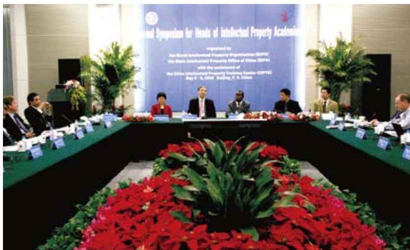
The Second Symposium for Heads of Intellectual Property Academies.

From May 8 to 9, SIPO and WIPO jointly organized the Second Symposium for Heads of Intellectual Property Academies in Beijing. Twenty-nine representatives from 17 countries, regions and international organizations including WIPO, USPTO, JPO and EPO attended the symposium. The symposium approved Beijing Action Plan, solidifying the communication platform of Worldwide Academy Net.