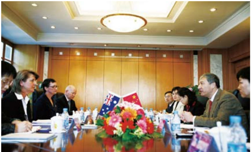
Commissioner Tian Lipu met with IP Australia Deputy Director General.