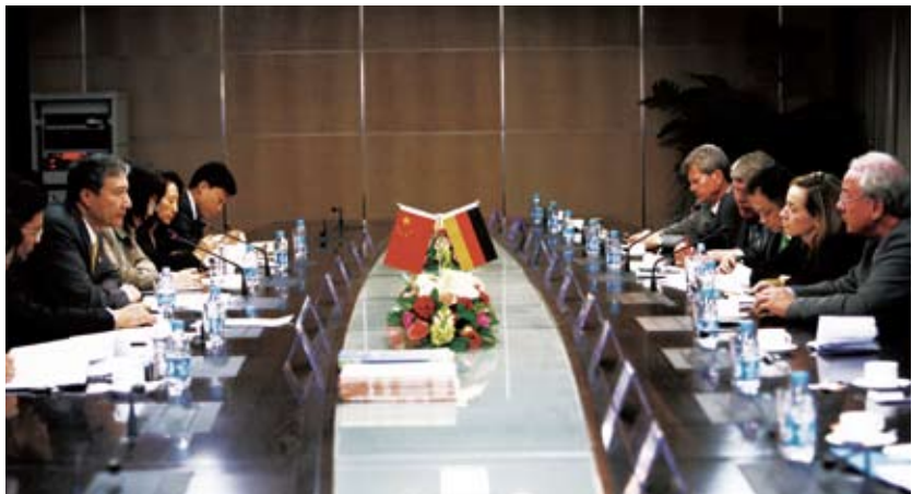
Commissioner Tian Lipu met with members of Germany Parliament Internal Affairs Committee.