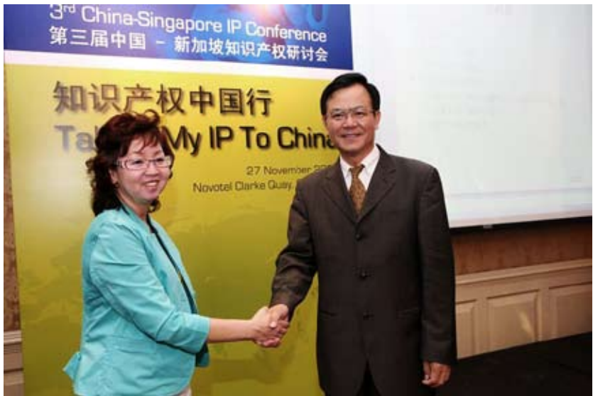
Deputy Commissioner Li Yuguang at the Third China–Singapore IP Conference.