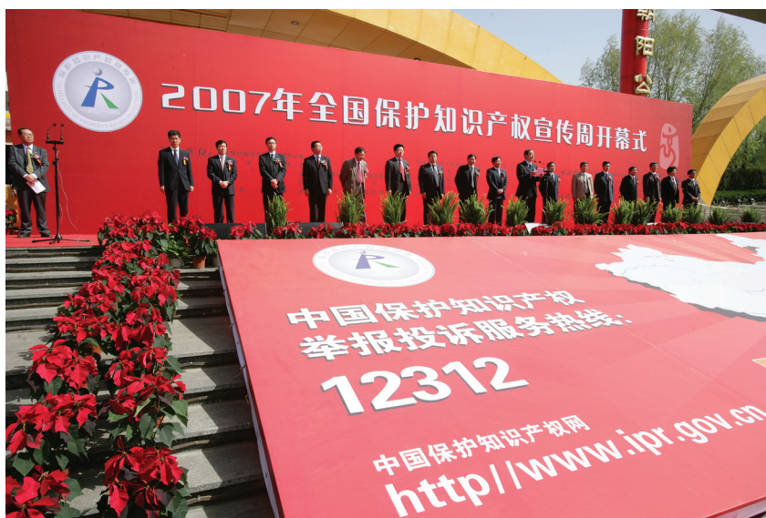
April 20, National IPR Publicity Week opened.