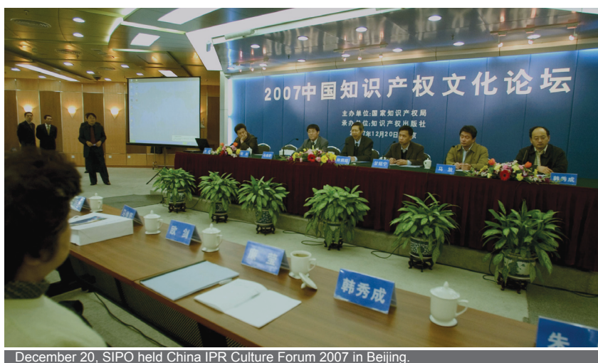
December 20, SIPO held China IPR Culture Forum 2007 in Beijing.