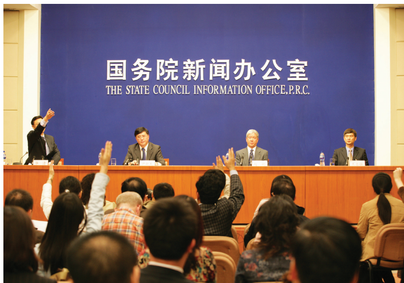
April 17, press conference on Intellectual Property Protection in China 2007.

started the construction of IPR exhibition center, elevating the theme to History of IPR Work, expanded one patent hall which displayed gold-medal inventions in real articles, images and texts. The center received 2,364 visitors all year.