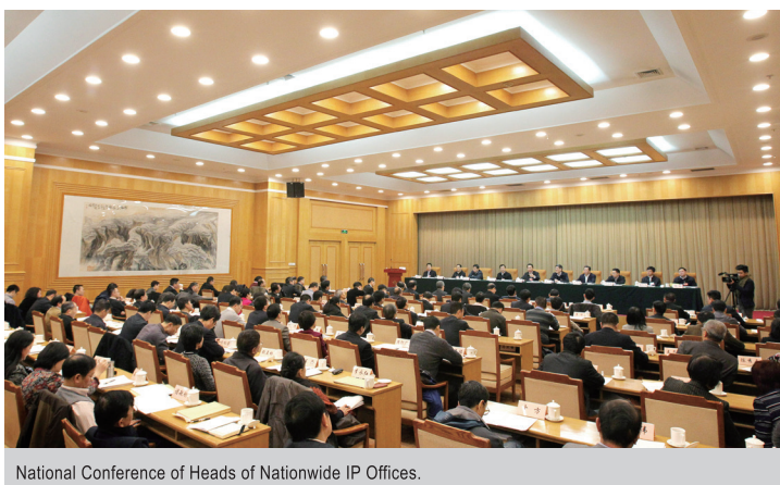
National Conference of Heads of Nationwide IP Offices.

On January 12, the Symposium on the Commemoration of the 35 th Anniversary of the Establishment of SIPO was held in Beijing.