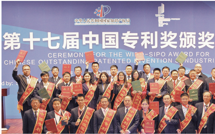
The 17 th Ceremony for the WIPO-SIPO Award for Chinese Outstanding Patented Invention and Industrial Design.

On December 18, State Council issued the Opinions on Accelerating the Construction of China with Strong Intellectual Property Competence under the New Situation .