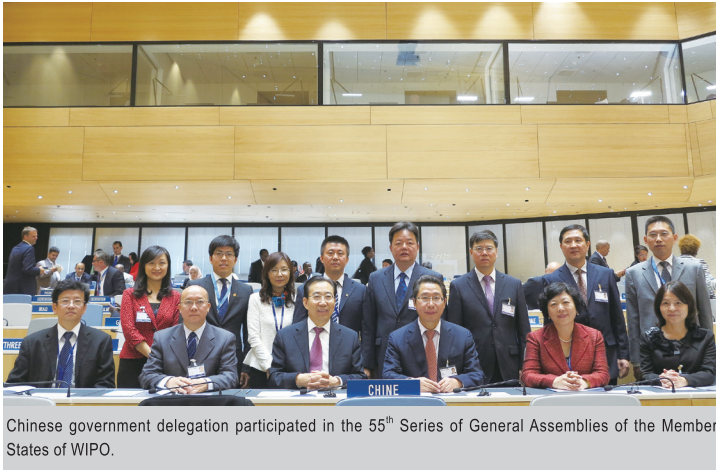
Chinese government delegation participated in the 55 th Series of General Assemblies of the Member States of WIPO.

From October 5 to 7, Commissioner Shen Changyu headed the delegation to attend the 55 th Series of General Assemblies of the Member States of WIPO, as well as the 5 th session of the Meeting among Heads of BRICS IP Offices.