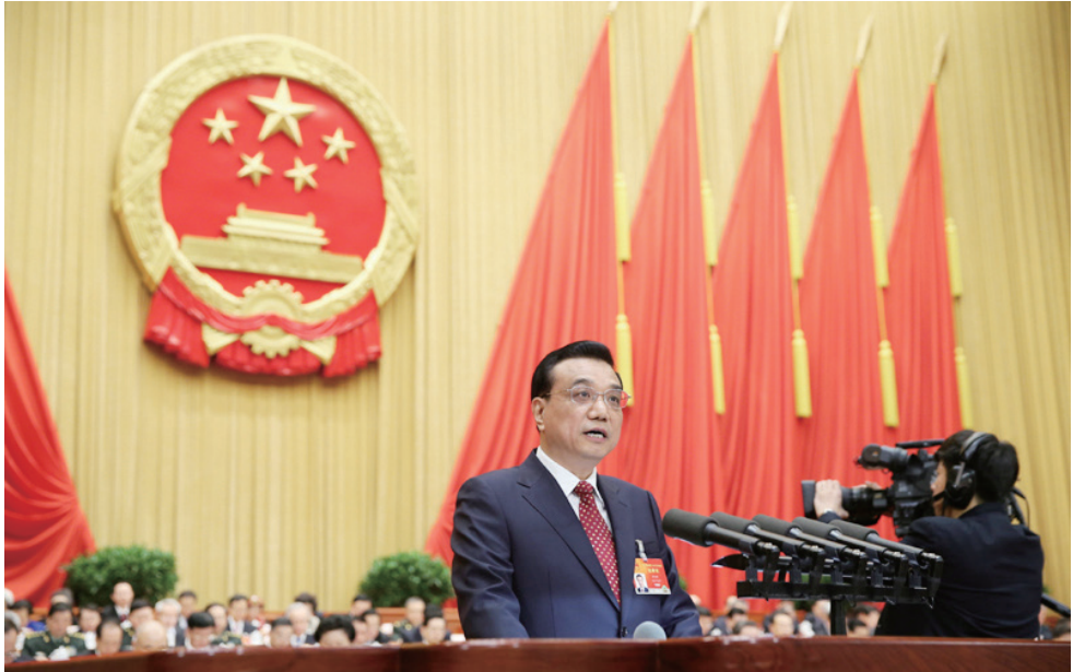
On March 5, Premier Li Keqiang delivered the Report on the Work of the Government, in which he put forward that "We will fully implement the action plan for carrying out the national strategy on intellectual property rights, crack down on infringements, and ensure inventions and creative work are thoroughly protected to keep innovation thriving."