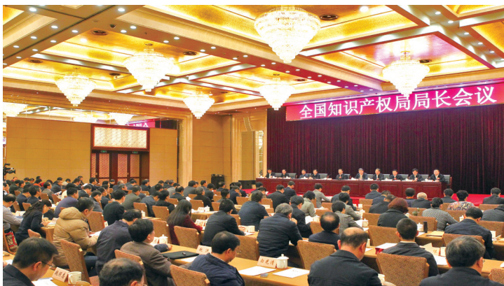
2016 National Conference for Heads of Nationwide Intellectual Property Offices.