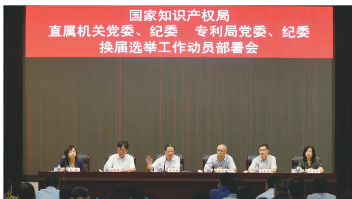
Xiao Xingwei, Member of SIPO's Party Group, Secretary of the Committee of Direct Affiliated Party Organizations of SIPO, chaired the preparation meeting for the elections of the Committee and Discipline Committee of Direct Affiliated Party Organizations of SIPO and the Committee and Discipline Committee of the Party Organizations of the Patent Office of SIPO.

On 19 September, the 7 th Five Plan (2016—2020) for publicity of IP laws nationwide was released.