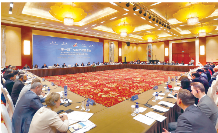
The Roundtable on Intellectual Property for Countries along the “Belt and Road”.

On 3 August, the Seminar on Patent Quality was held.