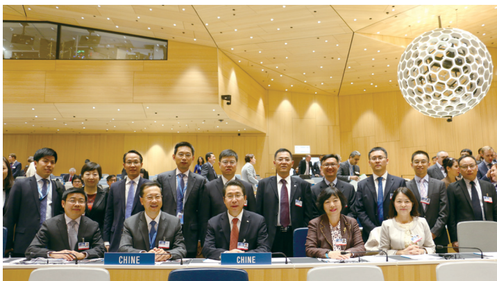
Commissioner Shen led the Chinese delegation to participate in the 56 th General Assembly and related meetings of the World Intellectual Property Organization.

From 19 to 20 September, the 7 th Patent Information Annual Conference of China was held in Beijing.