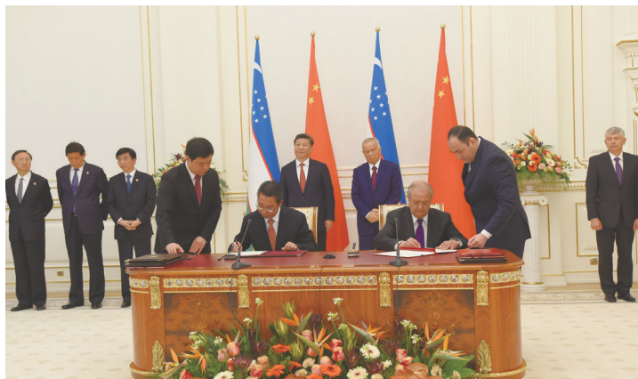
The Cooperation Agreement between the Government of the People's Republic of China and the Government of the Republic of Uzbekistan on Cooperation in the Field of Intellectual Property Protection was signed in Tashkent, Uzbekistan.

On 30 June, the preparation meeting for the special inspection on SIPO's Party Group by the 10 th Central Disciplinary Inspection Group was held.