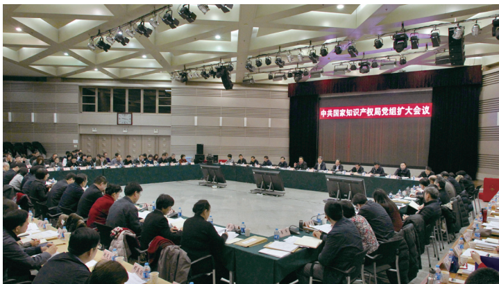
The Enlarged Meeting of the Party Group of the State Intellectual Property Office.