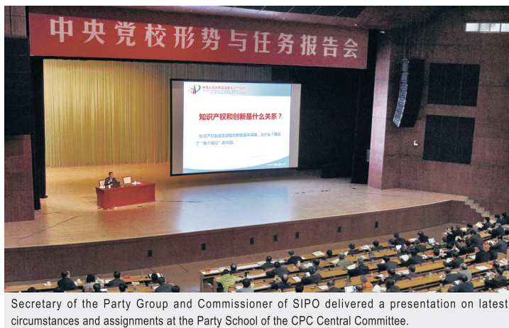
Secretary of the Party Group and Commissioner of SIPO delivered a presentation on latest circumstances and assignments at the Party School of the CPC Central Committee.

On 2 December, Secretary of the Party Group and Commissioner of SIPO delivered a presentation on latest circumstances and assignments at the Party School of the CPC Central Committee.