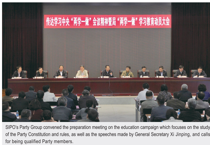
SIPO's Party Group convened the preparation meeting on the education campaign which focuses on the study of the Party Constitution and rules, as well as the speeches made by General Secretary Xi Jinping, and calls for being qualified Party members.

On 9 April, the 1 st China Intellectual Property Summit was held in Beijing. Commissioner Shen emphasized the importance to establish integrated IP protection.