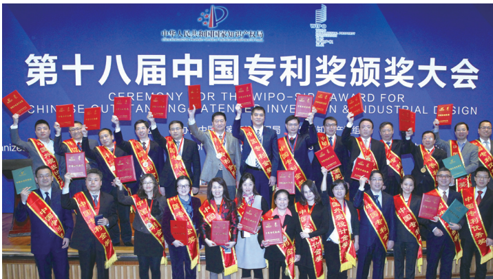
Award winners of the WIPO-SIPO Award for Chinese Outstanding Patented Invention and Industrial Design.