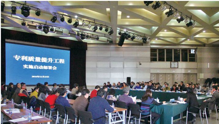
Preparation meeting for the implementation of the Patent Quality Improvement Project.