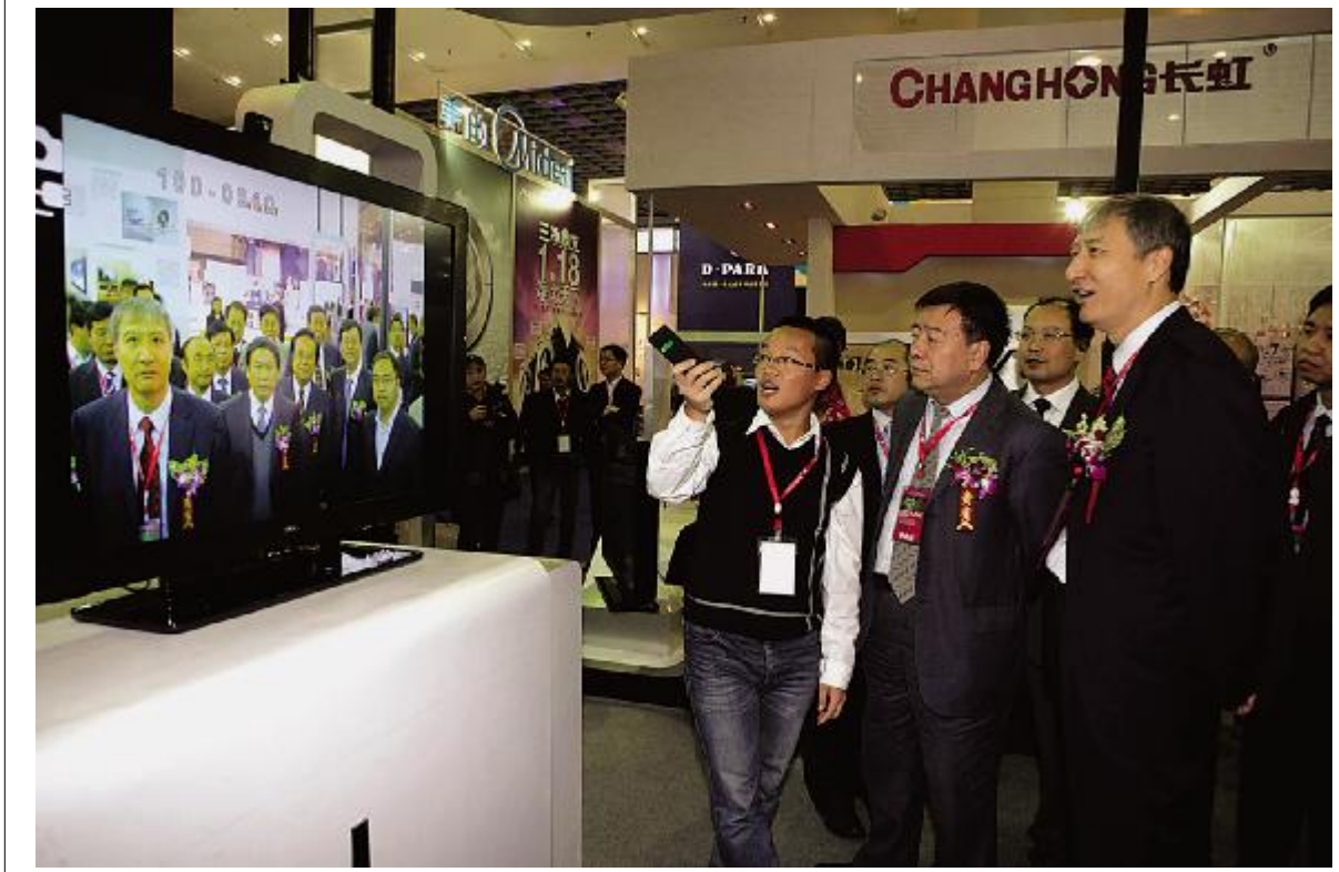
The Sixth China (Wuxi) International Industrial Design Expo and the Selection of 2008 China Industrial Design Award opened on November 8 in Wuxi, Jiangsu. SIPO Commissioner Tian Lipu visits the Expo. 11月8日,第六届中国(无锡)国际工业设计博览会暨2008创新盛典中国创新设计评选活动开幕式在江苏省无锡市举行。图为中国国家知识产权局局长田力普等正在博览会上参观。