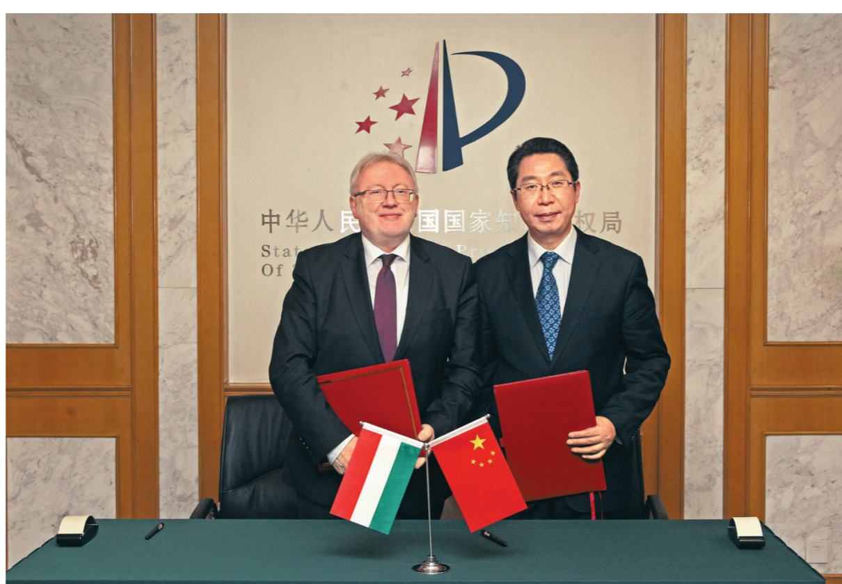
4月29日,中国国家知识产权局局长申长雨(右)在京会见了匈牙利知识产权局局长米克洛斯·本德塞尔。申长雨表示,发展与匈牙利知识产权局的合作关系,有利于双方权利人和创新主体受益,有利于双方经济发展。希望双方共同努力,携手共进,开启两局合作的新篇章。米克洛斯·本德塞尔表示,知识产权对于两国经济发展非常重要,十分希望不断推进双方的合作进程。会谈后,中匈两局签署了合作谅解备忘录。本报记者 张子弘 赵建国 摄影报道

近日,世界知识产权组织中国暑期学校在上海开班。该暑期学校旨在为全球优秀学生与青年专业人士提供一次集中学习、分享、交流知识产权专业知识的机会。来自多个国家的64名学员参加了学习课程。