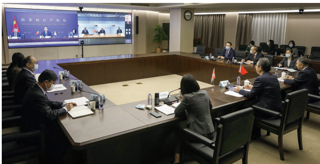
The 15 th Heads Meeting Between CNIPA and EPO

CNIPA and EPO virtually, and signed the 2022 CNIPA-EPO work plan and an agreement on EPOQUE Net.