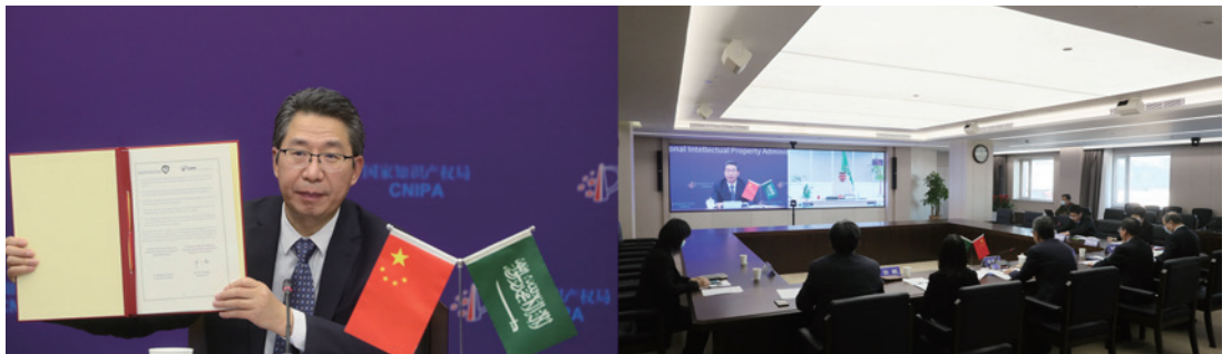
Video Conference and Signing Ceremony Between CNIPA and SAIP