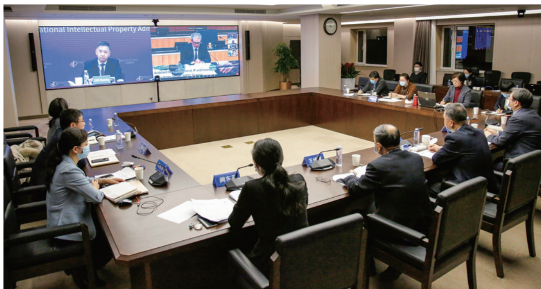
Global TISC Conference held Jointly by CNIPA and WIPO