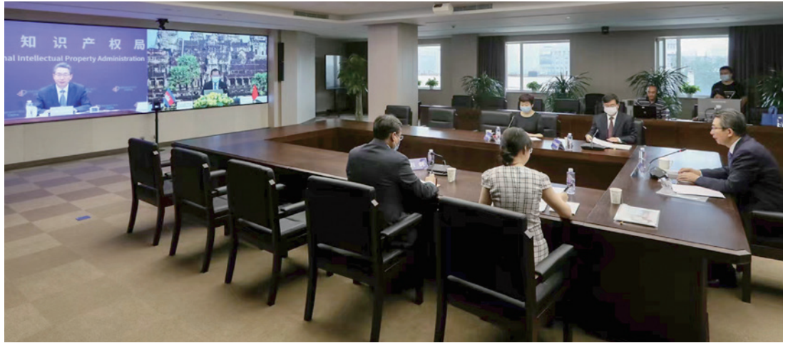
The China-Cambodia High-Level Meeting on Intellectual Property