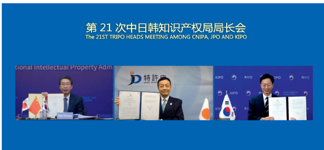
The 21 st TRIPO Heads Meeting Among CNIPA, JPO and KIPO

The cooperation projects with the JPO and KIPO in patent examination, industrial designs, automation, reexamination, trademarks, personnel training and other fields progressed steadily via video conferences and email correspondence. Cooperation were expanded to new technological fields, including expert exchanges on examination standards regarding AI technologies with JPO, information exchanges in AI fields with KIPO, and exchanges on patent examination regarding carbon neutrality with JPO and KIPO.