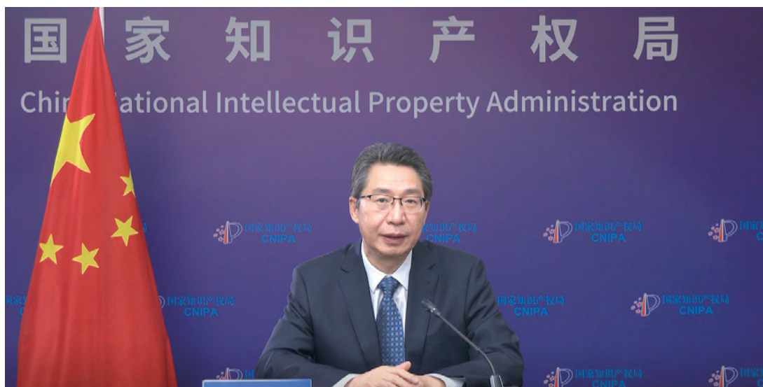
Commissioner Shen Changyu delivering a general speech via video at the 62 nd Session of the Assemblies of the WIPO Member States

calling for a more positive role of WIPO in response to global challenges, further improvements of WIPO's global IP service system, and more effective security controls on user data. Commissioner Shen Changyu and Deputy Commissioner Gan Shaoning were elected as Vice-Chairmen of the Assembly of the Paris Union and the Assembly of the PCT Union respectively.