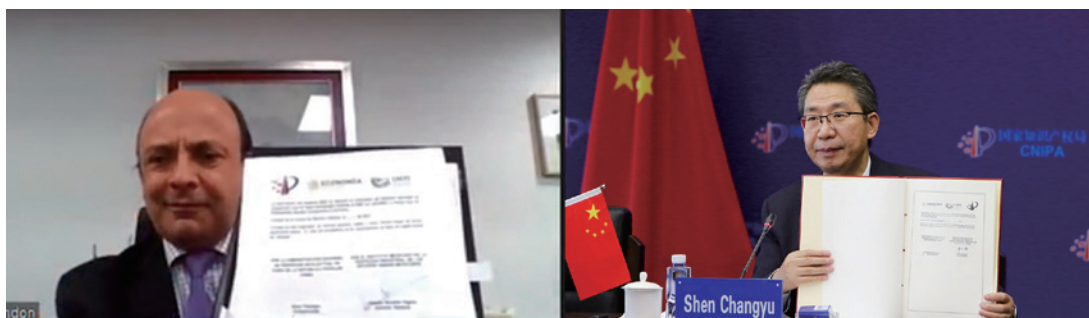
A MOU signed by CNIPA and the Mexican Institute of Industrial Property