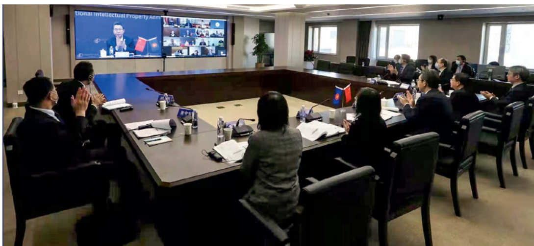
The 12 th Meeting of China-ASEAN Heads of IP Offices

In December, CNIPA hosted the 12 th Meeting of China-ASEAN Heads of IP Offices. At the meeting, CNIPA presented the progress on implementing the China-ASEAN IP Cooperation Work Program 2020-2021 , and shared China's countermeasures in the IP field against the COVID-19 pandemic. The China-ASEAN work plan for the year 2021-2022 was adopted.