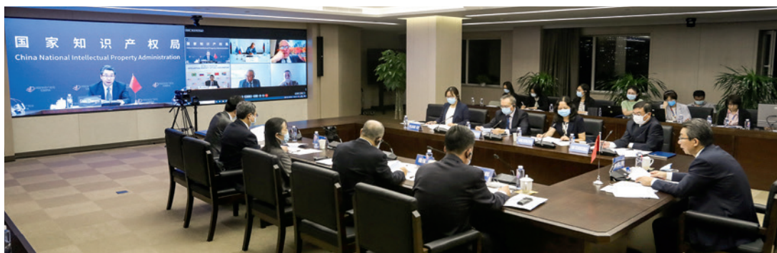
The 13 th BRICS Heads of Intellectual Property Offices (HIPO) Meeting

best practices in leveraging IP for targeted poverty alleviation, and introduced the achievements made in boosting IP competitiveness and promoting national development. The Minutes of the 13 th BRICS Heads of Intellectual Property Offices (HIPO) Meeting was signed subsequently.