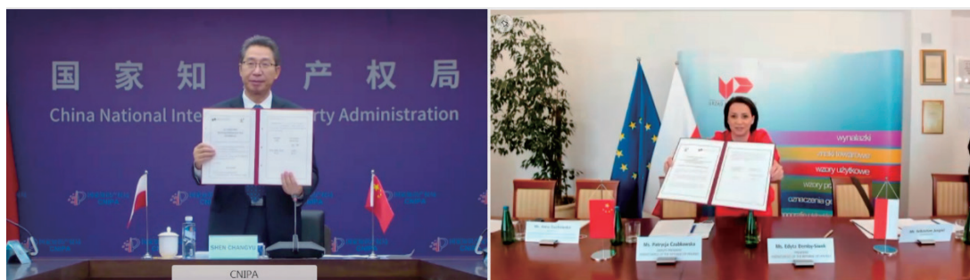
The Online Signing Ceremony Between CNIPA and the Patent Office of the Republic of Poland