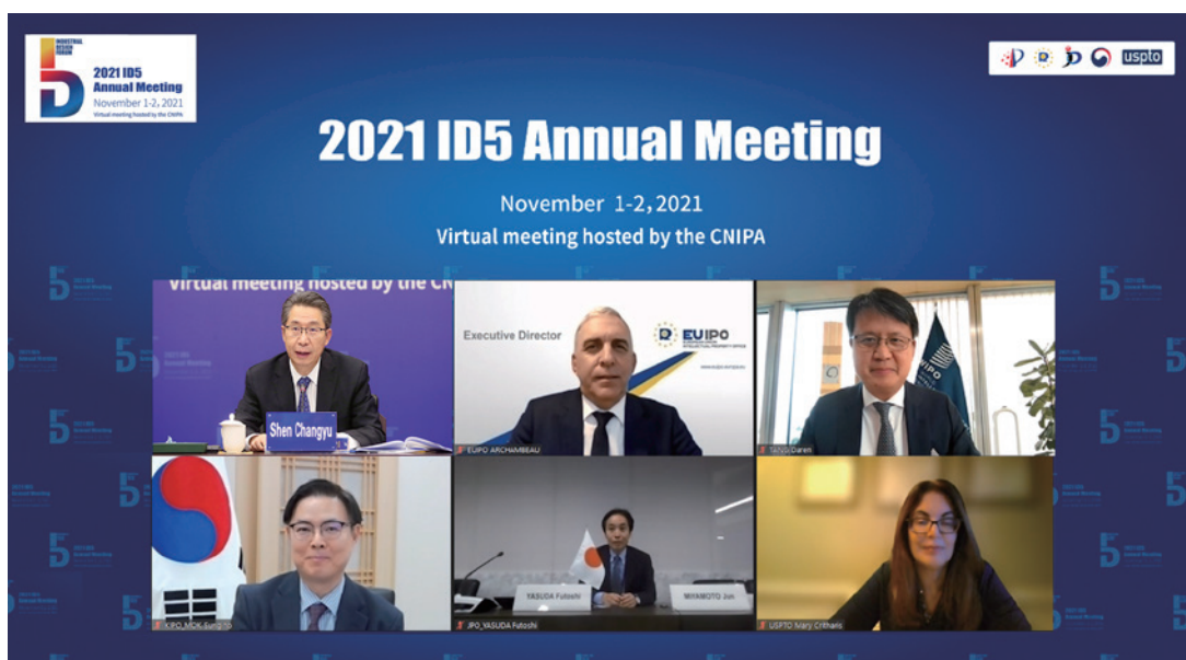
The 2021 ID5 Annual Meeting

Operational Guidelines . At the TM5 Annual Meeting, the latest progress and next steps of the 16 ongoing cooperation projects were discussed, 2 new projects including "Trademark Protection in the Opposition and Review Procedure" jointly proposed by CNIPA and EUIPO and "Trademark Archives Management and Administration" proposed by CNIPA were adopted, and views were exchanged on the optimization of the TM5 operation mechanism.