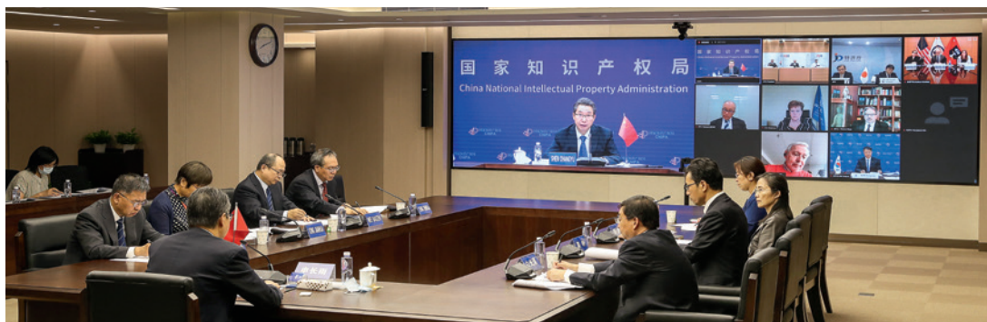
The 14 th IP5 Heads of Office Meeting

over the past year, and passed future work plans in several key areas, including cooperation on new emerging technologies and artificial intelligence (NET/AI), harmonization of patent practices and procedures, improving examination quality and efficiency, etc.