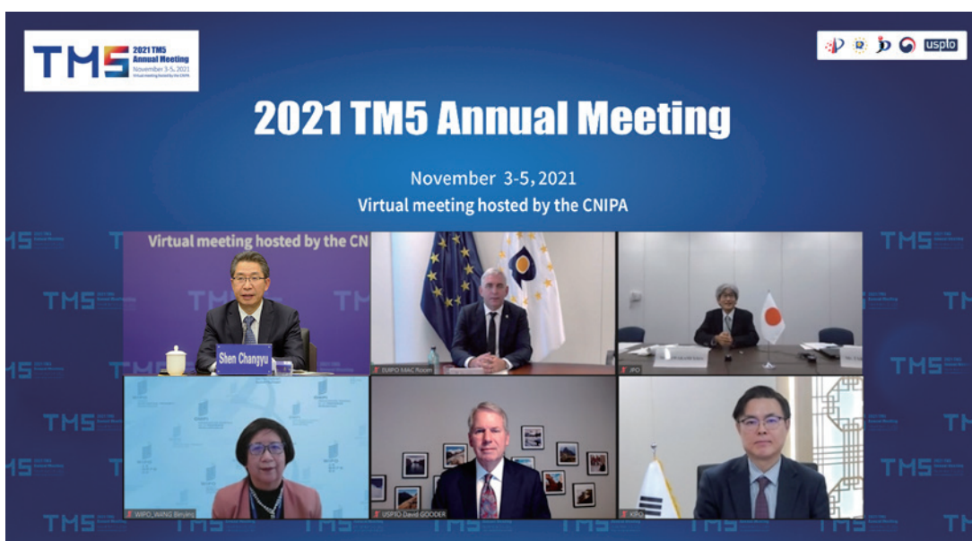
The 2021 TM5 Annual Meeting