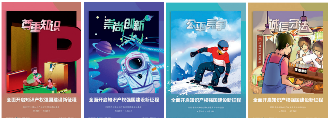
Embarking on a New Journey to Build China into an IP Powerhouse – 2022 National IP Publicity Week

was held with the theme of “Embarking on a New Journey to Build China into an IP Powerhouse”. The 2022 High-Level Forum on China IP Protection was held, with the theme of “Beef Up IP Protection in an All-Around Way to Optimize Innovation and Business Climate”.