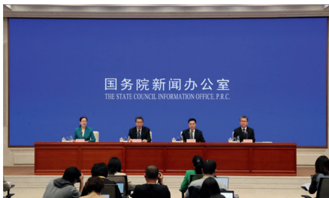
2021 Press Conference on China's IP Development