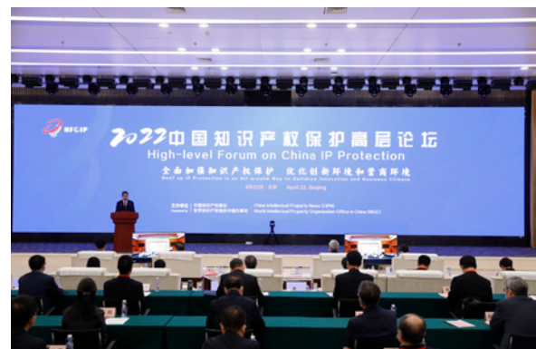
2022 High-Level Forum on China IP Protection