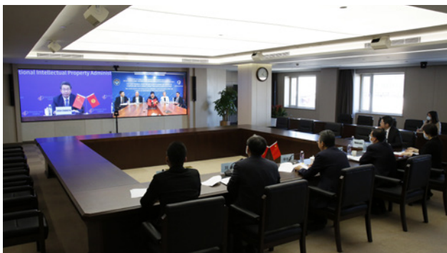
In March, Commissioner Shen Changyu meeting with the Director of Kyrgyzpatent

In March, Commissioner Shen Changyu had talks with the heads of the State Agency of Intellectual Property and Innovation under the Cabinet of Ministers of the Kyrgyz Republic (Kyrgyzpatent) and the Department of Intellectual Property, Ministry of Industry and Commerce of the Lao People's Democratic Republic, respectively, to have exchanges in depth on bilateral cooperation.