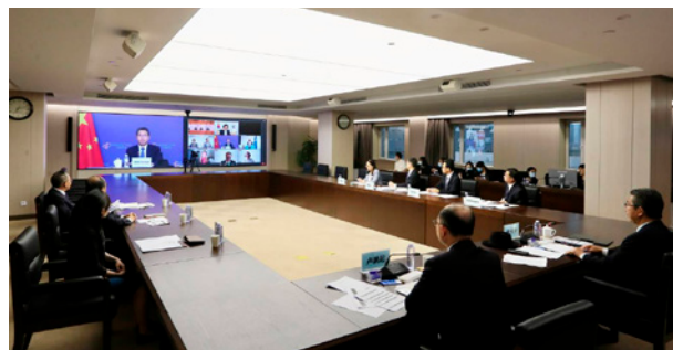
The 15 th IP5 Heads of Office Meeting in June