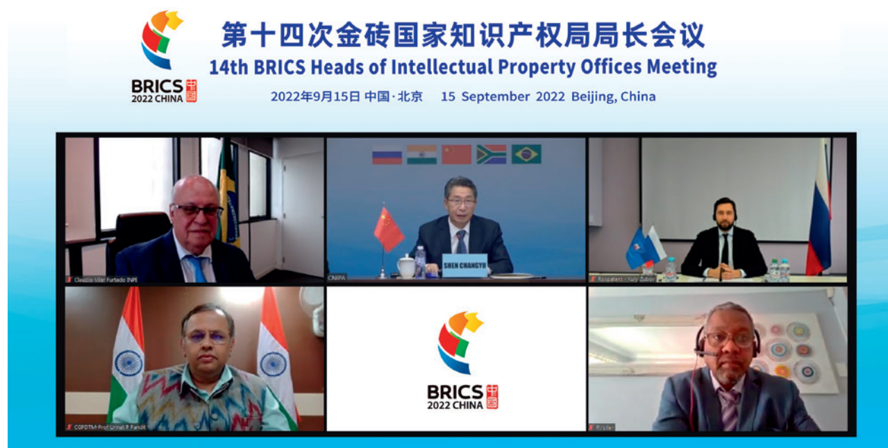
The 14 th BRICS Heads of Intellectual Property Offices Meeting in September

was adopted, and “enhance the role of IP for achieving the UN Sustainable Development Goals” was included in the cooperation objectives.