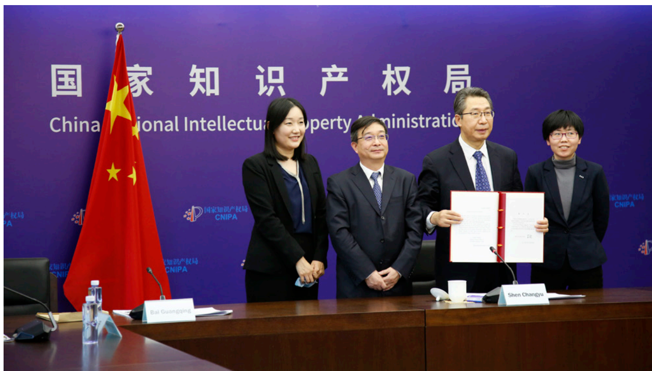
China depositing the instrument of accession to the Hague Agreement Concerning the International Registration of Industrial Designs on 5 th February