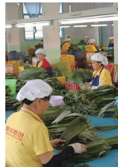
▲ Local farmers working in a bamboo leaves processing plant