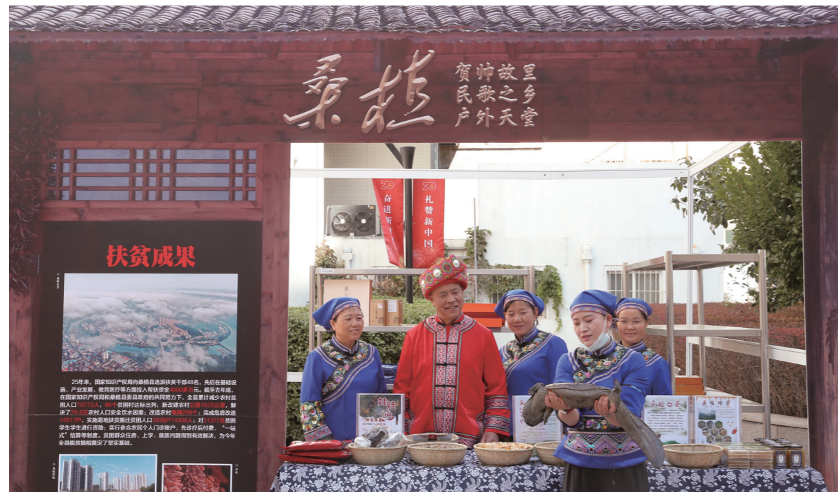
Sangzhi GI agricultural and sideline products displayed at the Food Festival of Poverty Alleviation Products held by CNIPA

CNIPA and Sangzhi County's efforts in leveraging IP advantages to boost local industries against poverty have been acknowledged by WIPO as "a world-class model of targeted poverty alleviation with intellectual property".