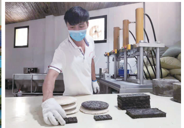
▲ GI Tea products presented in a local factory