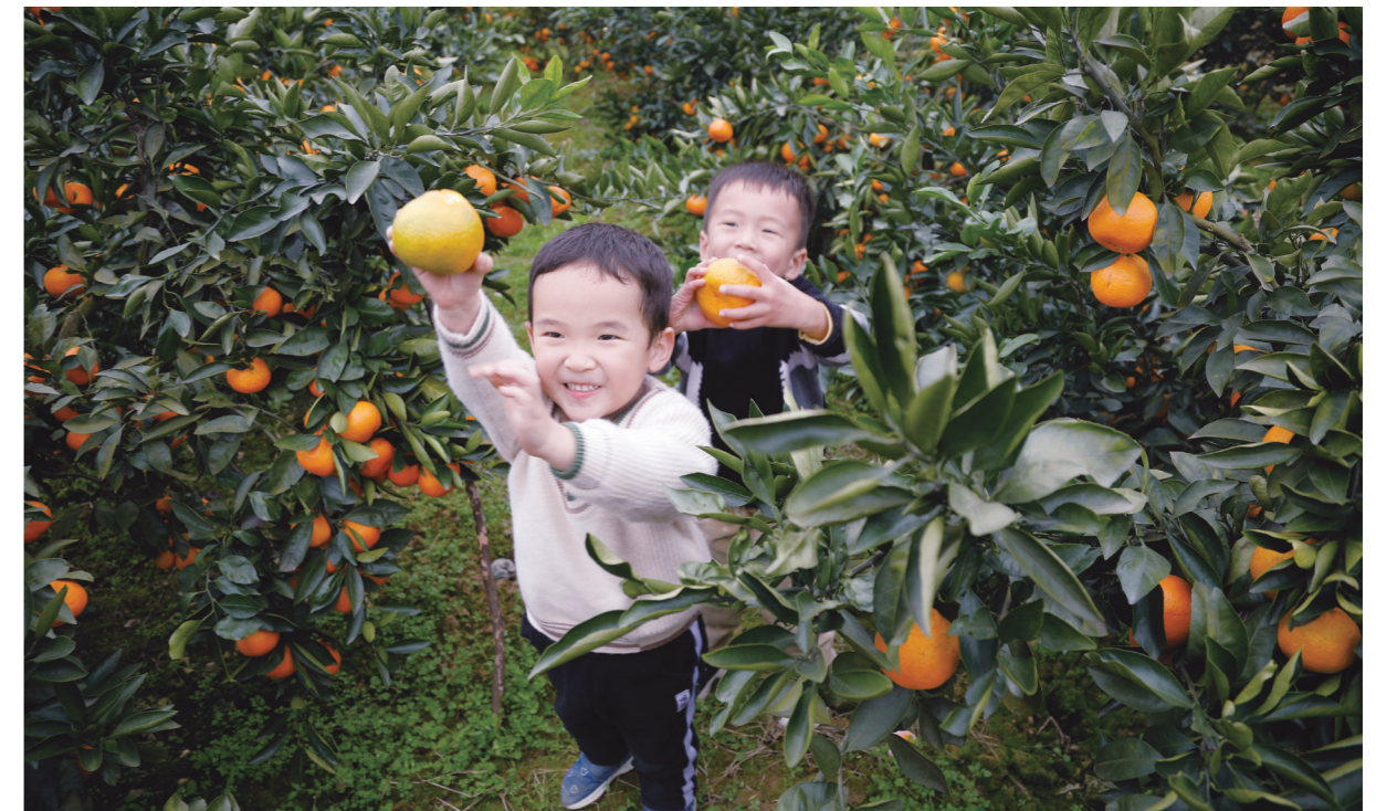
GI product "Chenggu Citrus" has led 200,000 people out of poverty in Chenggu County, Shaanxi Province