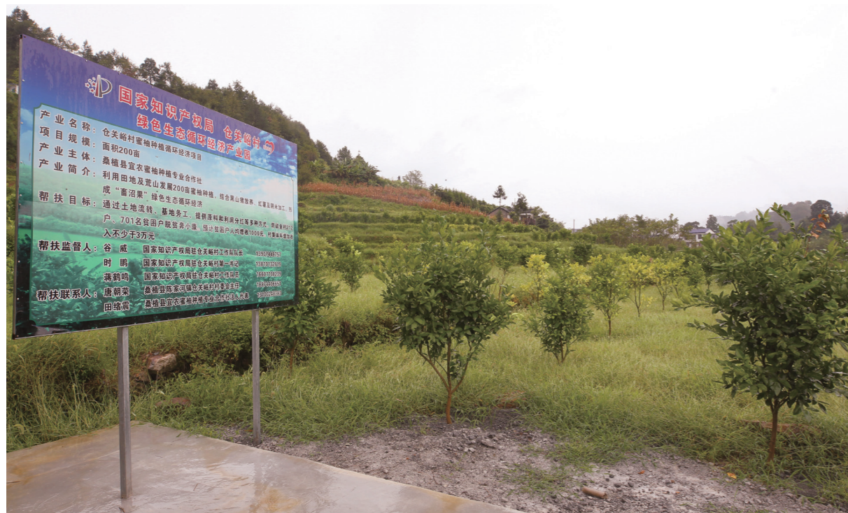
The Green Ecological Circular Economy Industrial Park built by CNIPA in Cangguanyu Village, Sangzhi County, Hunan Province

IP training for those regions during the COVID-19 pandemic. Training seminars were organized in Shanghai, Guangdong and other developed regions for personnel from poverty-stricken regions. A special online training column on poverty alleviation was set up on China Intellectual Property E-Learning Platform to facilitate the online learning of grassroots officials, professional and technical personnel in poverty-stricken regions. Besides, CNIPA has carried out special programs on county-level governance and IP capacity building to support grassroots officials in the designated poverty-stricken regions to receive training in developed regions.